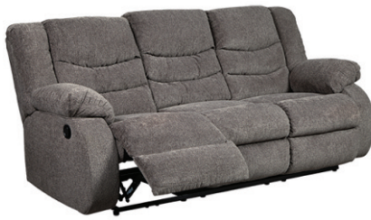
Ashley Reclining Sofa *Your choice of colors