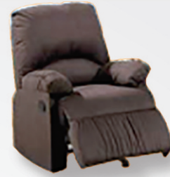
Wall Away Recliner