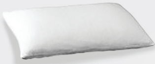
Ashley Queen Size Memory Foam Pillow