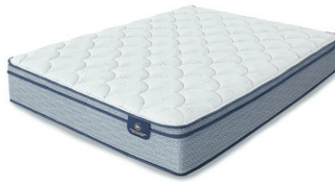
Queen Size Pillowtop Mattress Set