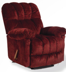
Best Rocker or Wall Away Recliners