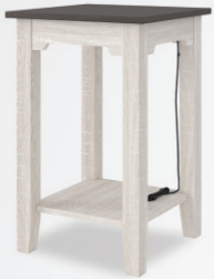
Assorted End Tables with USB Ports