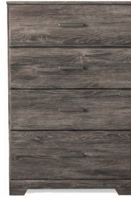
Ashley 4 Drawer Chest