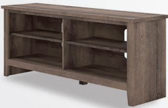
58" TV Console 2 finishes to choose from