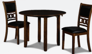
3PC Dropleaf Table Set