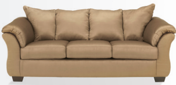
Darcy Mocha Sofa