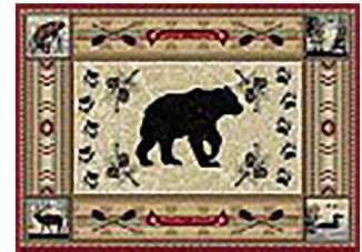
Rustic Room Size Rugs