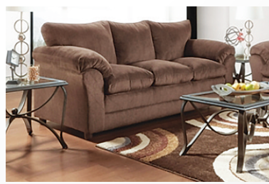
Kelly Contemporary Sofa