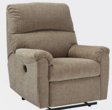
Ashley Power Recliner