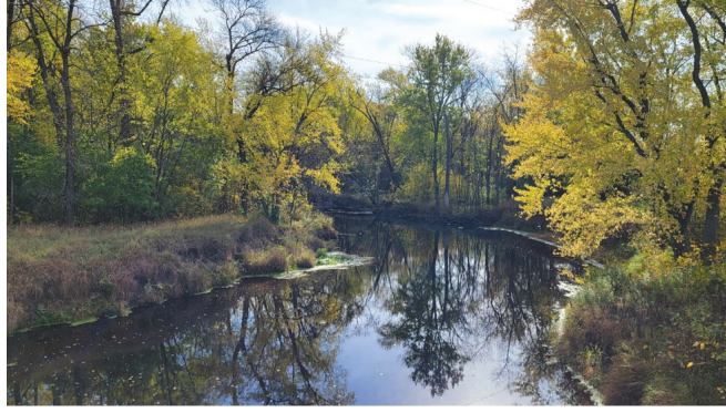
A view of the Rum River in autumn.

You are encouraged to attend the Mille Lacs Lake Watershed Group public meeting on Monday, Jan. 10 at 6:30 p.m. to be held at the Mille Lacs County Historic Courthouse or via Zoom. You can also respond to an online survey. When you think about the future of our area's water resources, what comes to mind? Do you have concern about their health and that of the farms, forests, prairies, and aquatic habitats they support? Do you desire they provide clean water for drinking and recreation? Do you want protection from floods and extreme weather events? You can share your hopes and concerns by responding now to a new comprehensive plan for the Rum River Watershed.