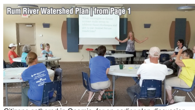
Citizens gathered in Onamia, for an earlier plan discussion.

What is an SWCD? The SWCD is a local government unit (with no taxing authority), created under Minnesota State Statute 103C, and a grassroots organization governed by five elected officials. Our mission is to provide local leadership and implement voluntary soil and water conservation projects through programs and partnerships to Crow Wing County and adjacent areas.