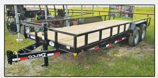
1-2 Day Services In Many Circumstances