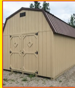
12x24 High Barn