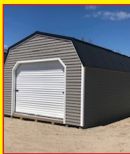
14x32 High Barn