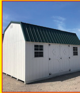
12x16 High Barn