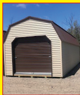
12x28 High Barn