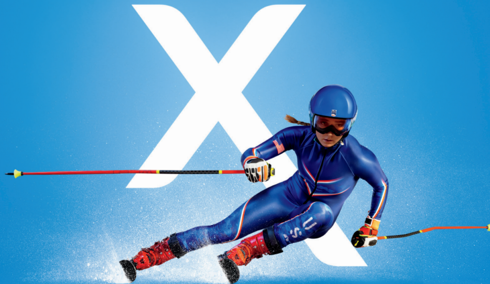
Mikaela Shiffrin U.S. Olympic Gold Medalist