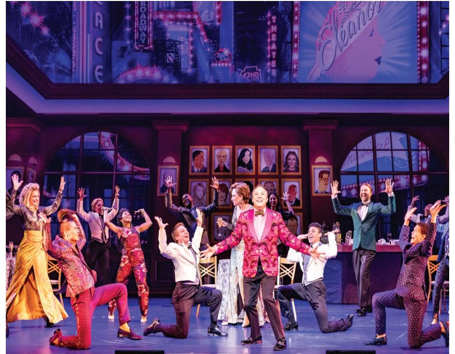
The National touring company of The Prom .