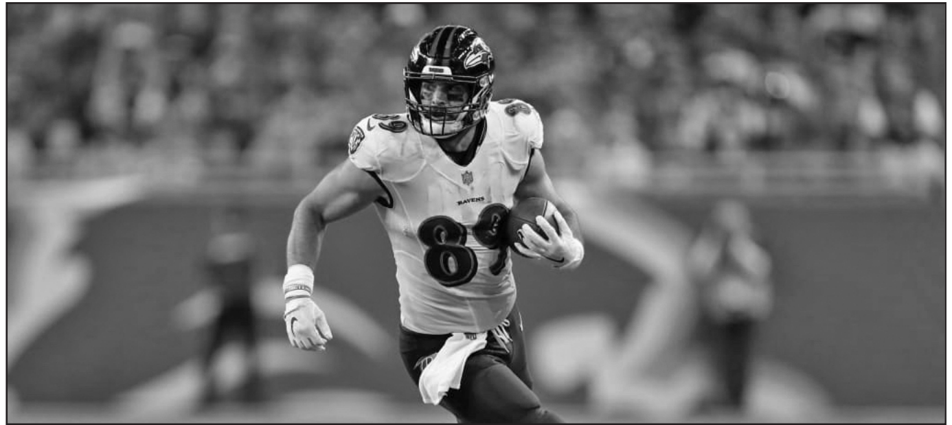
Quarterback Lamar Jackson; tight end Mark Andrews; fullback Patrick Ricard; kicker Justin Tucker; and return specialist Devin Duvernay are the five Ravens players on the 2022 AFC Pro Bowl roster. (Pictured) Ravens tight end Mark Andrews.

A good part of that is due to the lack of Ravens defensive players selected. Cornerback Marlon Humphrey and defensive tackle Calais Campbell were