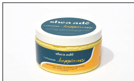
Shea Adé's 'I choose happiness' Whipped Shea & Mango Butter.

She added, "The superstar ingredient I like to use is Aloe Vera juice. I hear a lot of Black people say, 'My hair is so dry.' We believe we need more oil or more grease because that's how we were raised. But in actuality, we need more water. I use either water or Aloe Vera juice in my products. One of my star products is my Refreshing Tonic. It's a daily refreshing spray that you wake up