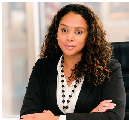
Marilyn J. Mosby, Baltimore City State's Attorney

I regularly ran into Mosby and her husband at a downtown black-owned restaurant. Later, as part of my Coppin State University Urban Studies program before the deceased Freddie Gray ordeal, I believe. The writer is just setting the record straight.