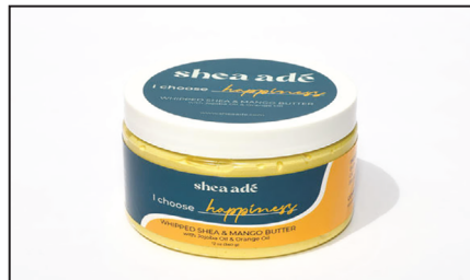
Shea Adé's 'I choose happiness' Whipped Shea & Mango Butter.

She added, "The superstar ingredient I like to use is Aloe Vera juice. I hear a lot of Black people say, 'My hair is so dry.' We believe we need more oil or more grease because that's how we were raised. But in actuality, we need more water. I use either water or Aloe Vera juice in my products. One of my star products is my Refreshing Tonic. It's a daily refreshing spray that you wake up