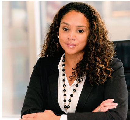
Marilyn J. Mosby, Baltimore City State's Attorney

I regularly ran into Mosby and her husband at a downtown black-owned restaurant. Later, as part of my Coppin State University Urban Studies program before the deceased Freddie Gray ordeal, I believe. The writer is just setting the record straight.