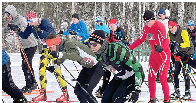
Racers ready for the 16k Skate race during Lumberjack Jaunt at the Northland Arboretum of Brainerd.