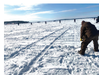
Following a grid, volunteers auger holes in the ice.

There are two notable characteristics about Jaycees Ice Fishing Extravaganza— it is entirely volunteer organized and run, and 100% of the proceeds are donated to