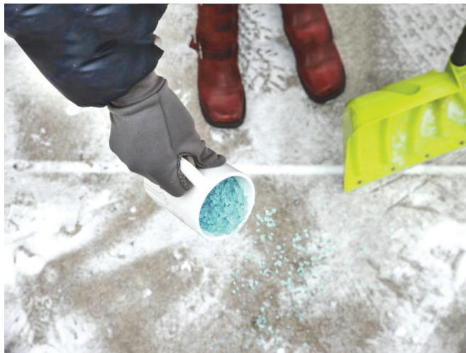
A coffee mug of salt will cover about 10 sidewalk squares, or a 20-foot driveway.