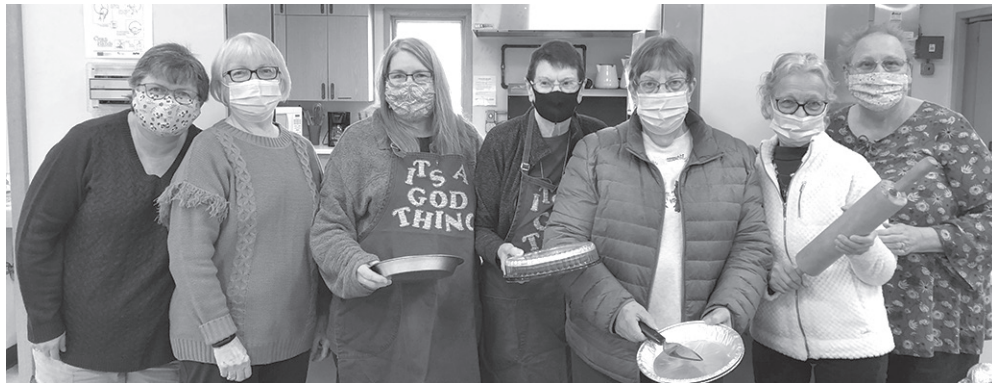
Cascade Ladies are inviting all area residents to attend their Pie Social on Saturday, February 12, 2022 from 1 p.m. to 3 p.m. at Cascade United Methodist Church, Deerwood. Enjoy a piece of homemade pie, ice cream and coffee for $5.00. Whole pie will also be available for purchase.