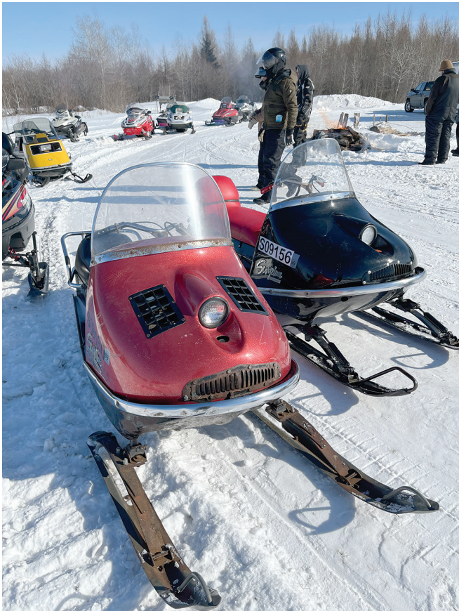
Vintage snowmobiles bring back memories for many riders at Winterwonderama Day in Aitkin.

Winterwonderama Day in Aitkin | Continued from Page 1