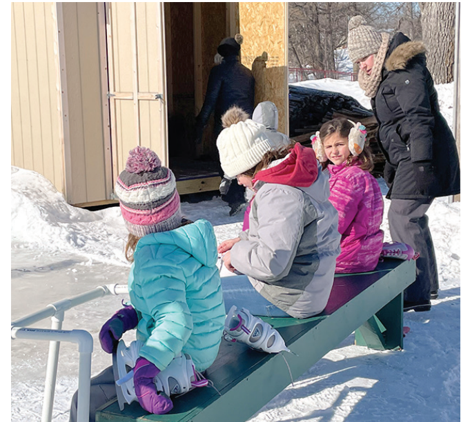
Children get their skates on to try out the ice in Aitkin. There is just a shed for a warming house now, but a new building is in the plans.