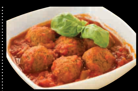
75% Lean Ground Beef 3.99 lb.