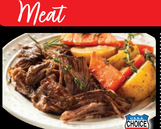
Chuck Tender Roast 5.29