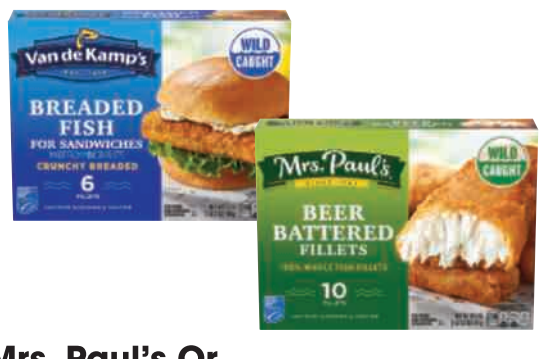
Mrs. Paul's Or

LIMIT ONE COUPON PER PURCHASE. ANY OTHER USE CONSTITUTES . Van de Kamp's FRAUD. Void if sold, copied, transferred, altered, prohibited or restricted. Good only in the USA and APO/FPO post office addresses. Consumer: No other coupon may be used with this coupon. Consumer pays any sales tax and will not receive any credit or cash back if coupon value exceeds purchase price. "2022 Conagra Brands, Inc. All Rights Reserved. ____ ... 18-24.6 oz. box