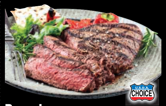
Boneless Sirloin Steaks USDA Choice Beef