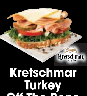
Off The Bone Deli Fresh Regular Or Honey