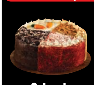
8 Inch Double Layer 4 Flavor Cake