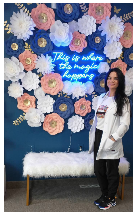
JEAN BONCHAK - THE NEWS-HERALD

The most requested procedure is Dysport, a sister drug to Botox that works to relax the muscles that are responsible for causing wrinkles with expression. Coleman noted that the process is essentially quick, painless and "takes years off of your face, leaving your skin looking more youthful as well."