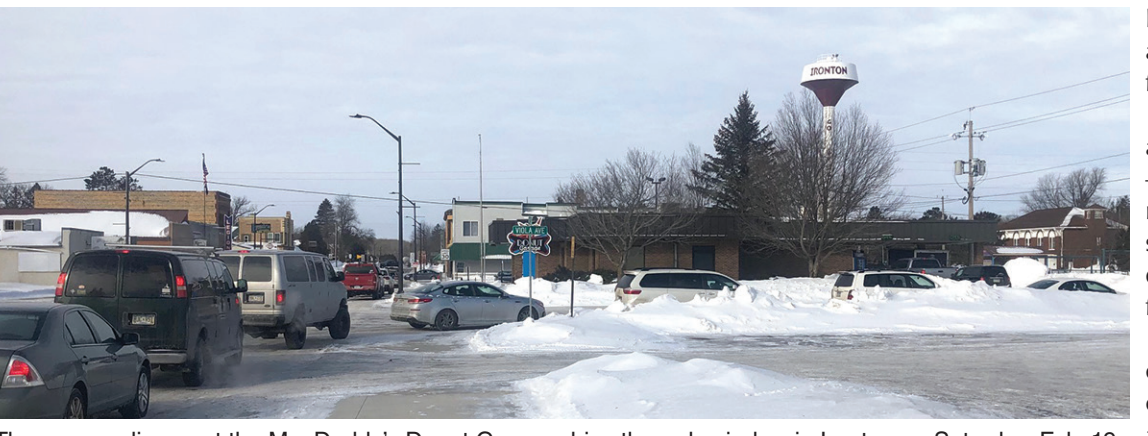
There was a lineup at the MacDaddy's Donut Garage drive through window in Ironton on Saturday, Feb. 19.