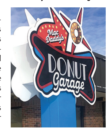
MacDaddy's Donut Garage is open Tuesday through Sunday on Ironton's main street - Hwy. 210.