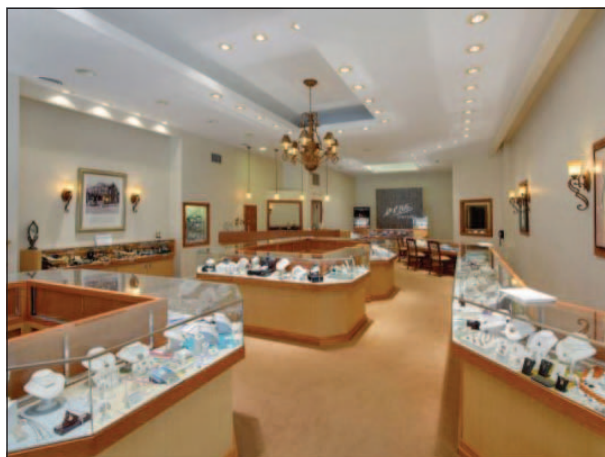
William H. Diller Jewelry Store in West Reading.

If you are already a member of our extended family, welcome back!