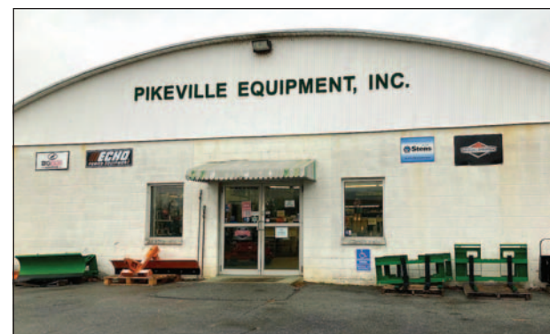
Pikeville Equipment Inc. in Pike Township.

The era of the business saw change from horse-