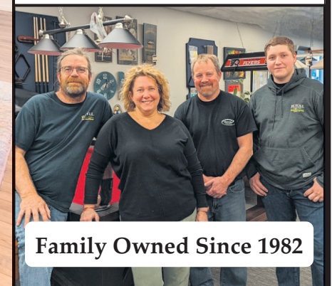
Family Owned Since 1982