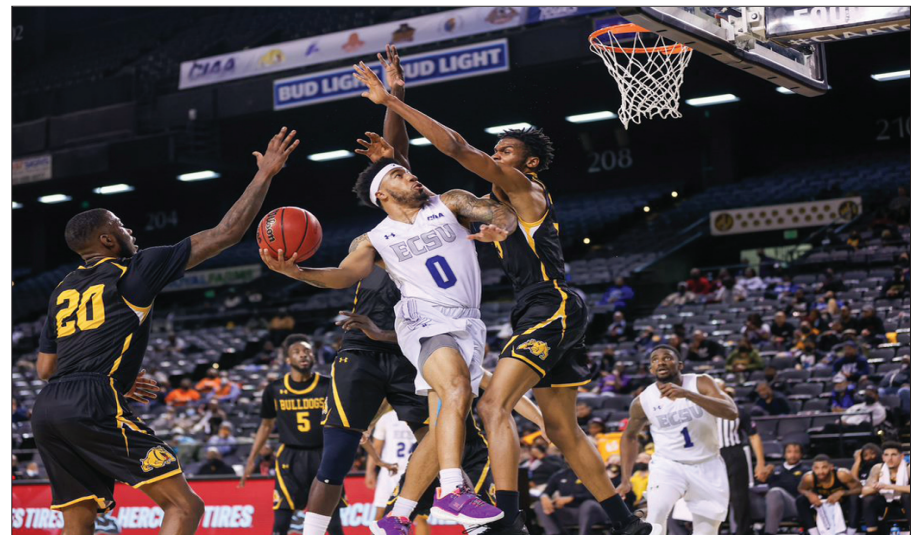
Photos Below (Left and Right): Highlights of the CIAA Bowie State University vs. Elizabeth City State University game. Final Score 60 – 52, Bowie State.