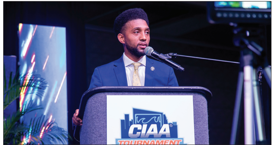
Mayor Brandon Scott welcomes the CIAA Tournament during the Men's and Women's Tip Off Awards earlier this week.