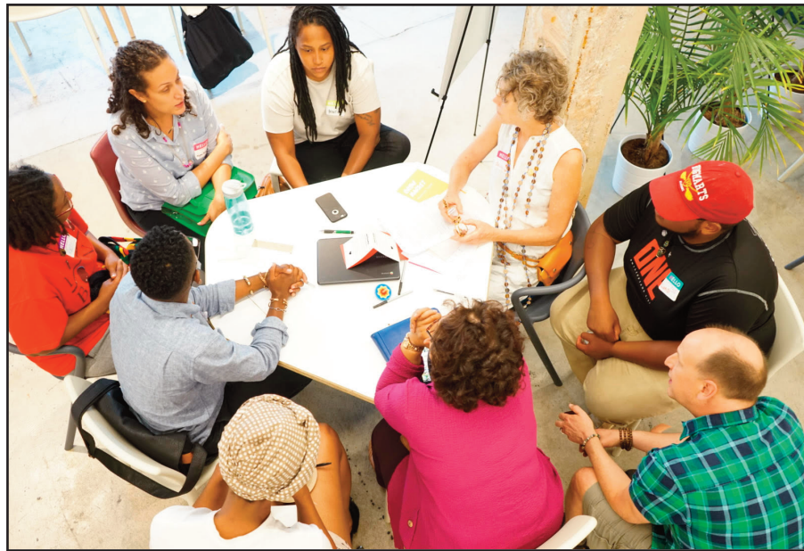
Empower by GoDaddy, is launching in Baltimore in partnership with Impact Hub Baltimore. While the first cohort deadline has already closed, applications are being accepted for all cohorts at: https://empowerbaltimore.com/home . (Pictured) Baltimore residents, innovators, entrepreneurs and community members connect at Impact Hub programs and events.

https://empowerbaltimore.com/home "GoDaddy chose Baltimore because of how many small and microbusinesses are located here. With more than 150,000 microbusinesses in and around Baltimore, we have three times the national average, which is a reflection of the strength of our entrepreneur