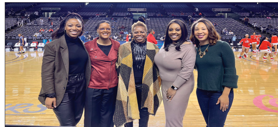
The first All-Female Black Broadcast Team in history called the game last night at the CIAA Basketball Tournament Bowie State University vs. Elizabeth City State University.