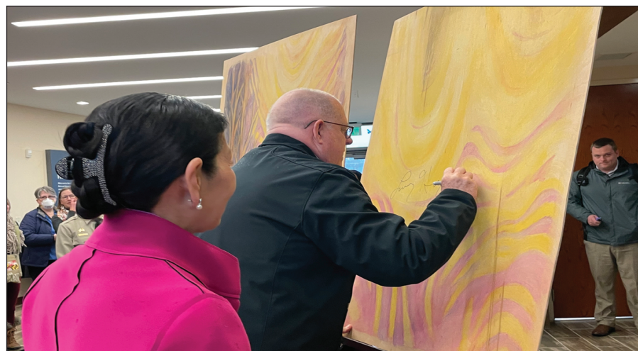
Governor Larry Hogan signs oversized birthday card commemorating Harriet Tubman’s 200 th birthday while First Lady Yumi looks on.