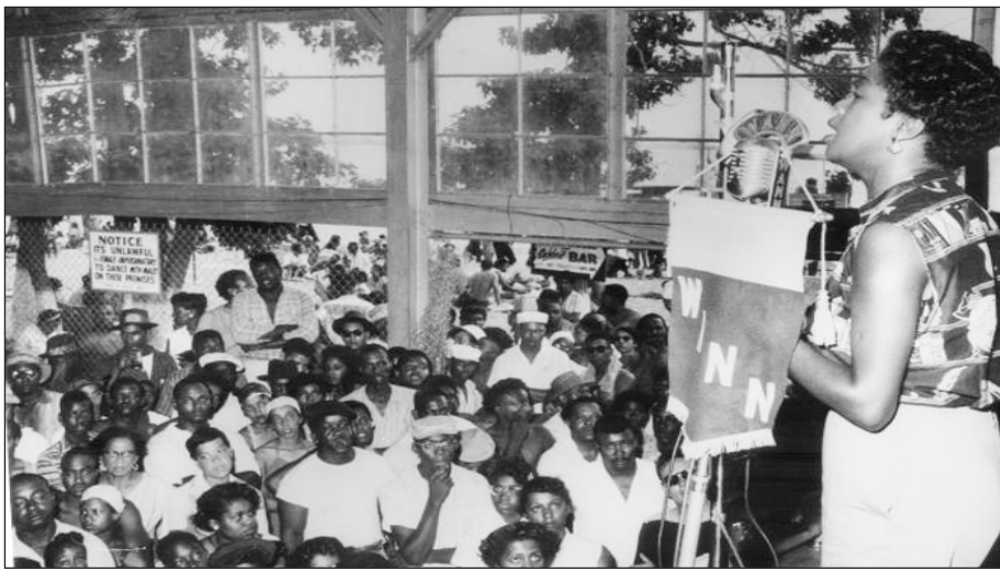
Sarah Vaughan speaks at Carr's Beach over WANN Radio in front of crowd.