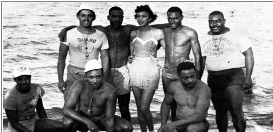
Carr's Beach Life Guards