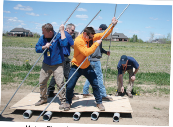
Metro Electric Teamwork Challenge