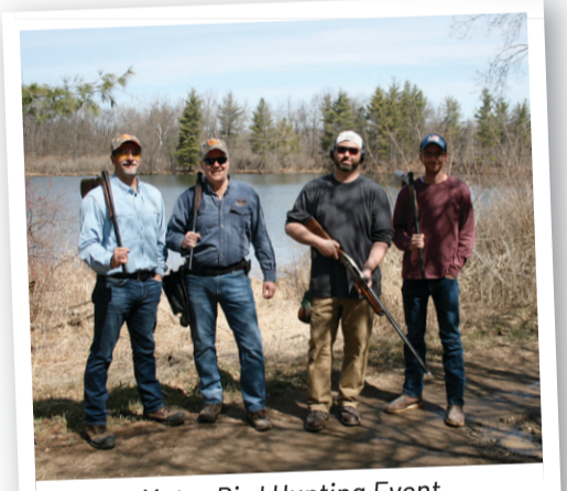
Metro Bird Hunting Event