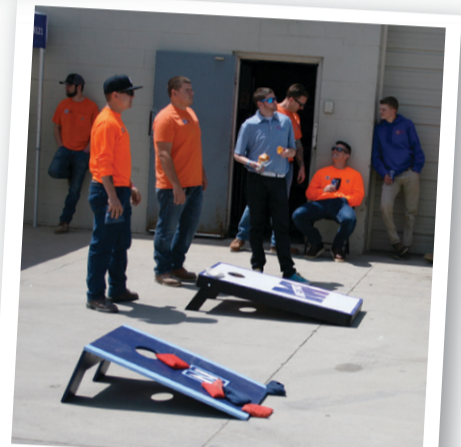
Metro Cornhole Tournament