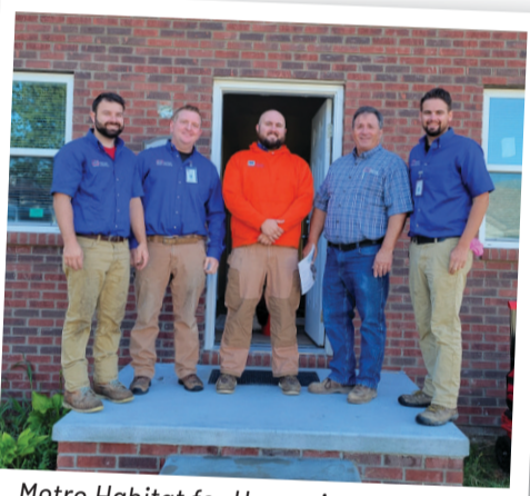
Metro Habitat for Humanity assistance