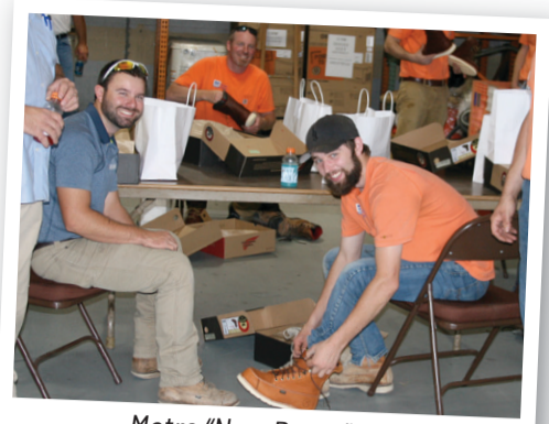
Metro "New Boots" Day