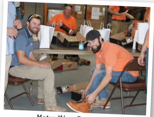
Metro "New Boots" Day