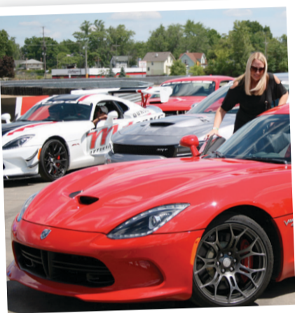
Metro / M1 Concourse Track Day