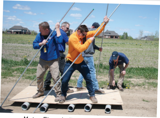
Metro Electric Teamwork Challenge