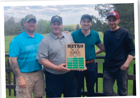
Annual Metro Cup Golf Tournament