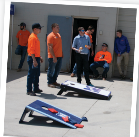
Metro Cornhole Tournament