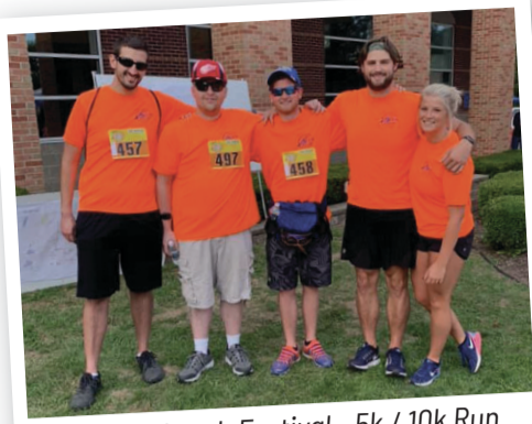
Romeo Peach Festival - 5k / 10k Run