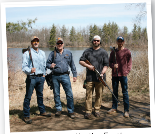
Metro Bird Hunting Event