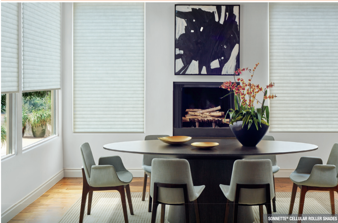
SONNETTE® CELLULAR ROLLER SHADES