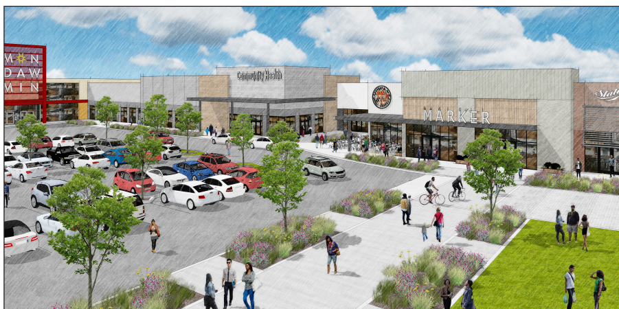
Rendering of future TouchPoint Empowerment Center

initiative. Furthermore, the business leader has projected a multi-million-dollar follow-on investment in the property according to the specific uses for the building as associated renovations are made.