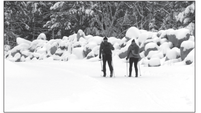
A pair of classic skiers enter boulder-strewn Bridge Trail at Rangeley Lakes Trails