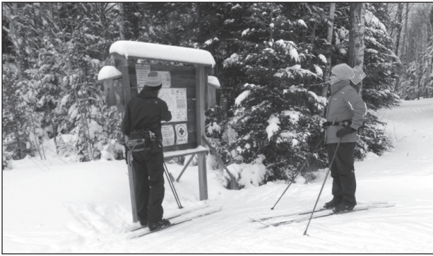
A large trail map on a kiosk at the Tote Road Junction helps skiers plan their itinerary