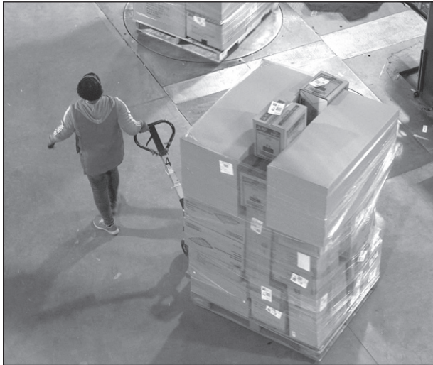
An OSJL distribution center associate moving a pallet of supplies for Ukraine.