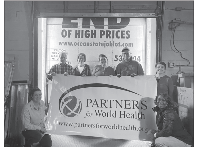
Representatives from Partners for World Health pose in front of an OSJL tractor trailer full of supplies for Ukraine.