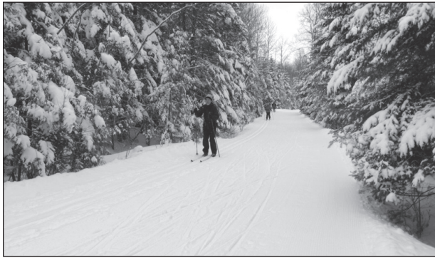
Skiers travel through the scenic Tote Road Trail at Rangeley Lakes Trails