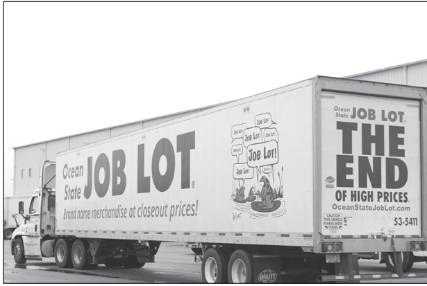
An OSJL tractor trailer.

North Kingstown, RI - (March 30, 2022) – Ocean State Job Lot (OSJL) is pleased to announce that its “Relief for Ukraine” program has resulted in the donation to date of six tractor trailer loads of health and hygiene products, nutritious food, and warm clothing, as well as frontline medical supplies to Ukrainian refugee efforts. The desperately needed medical supplies were supplied in partnership with Partners for World Health, based in Portland, ME.