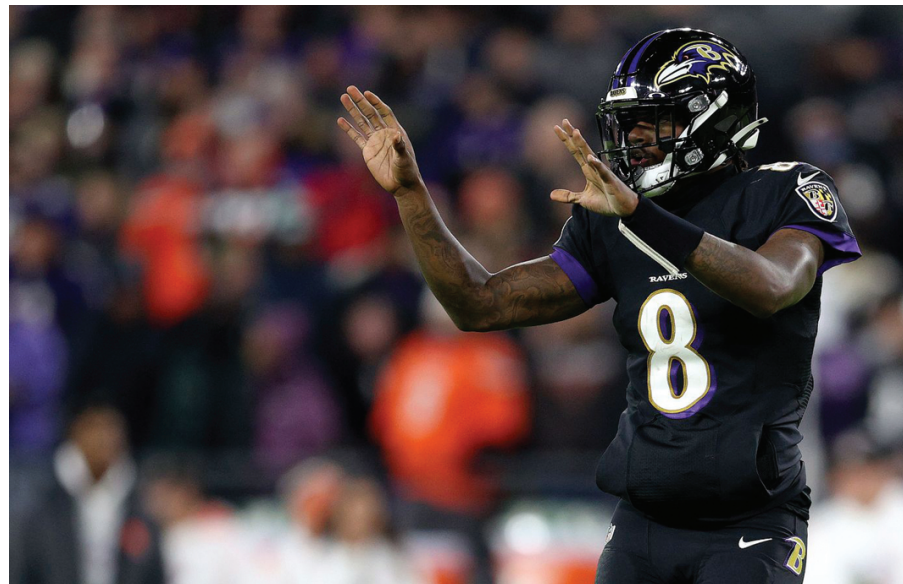
Lamar Jackson, Ravens quarterback

"I hope so, at some point, that we will. I think we've discussed this at length, and I said this before: We will work at Lamar's [Jackson] urgency. So, he and I have had ongoing discussions," general manager Eric DeCosta said at the Combine last month.