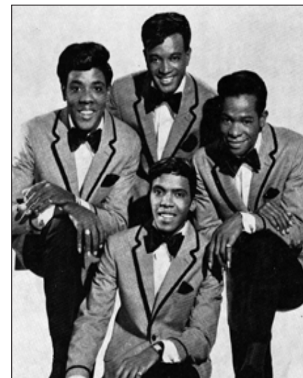
The Intruders, 1968