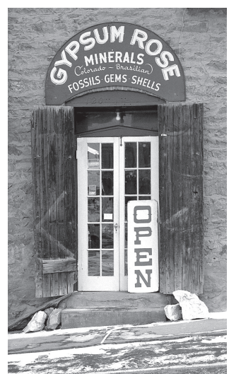
"Gypsum Rose,"

many times every day, but always know what we will find on the other side. Most of the doors I photograph I will never know what I am missing."