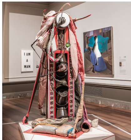
Daniel Lind-Ramos Figura de Poder, 2016–2020 mirrors, con- crete blocks, cement bag, sledge- hammer, construction stones bag, paint bucket, wood panels, palm tree trunk, burlap, leather, ropes, sequin, awning, plastic ropes, fabric, trumpet, pins, duct tape, maracas, sneaker, tambourine, working gloves, boxing gloves, acrylic overall: 274.32 x 152.4 x 119.38 cm (108 x 60 x 47 in.) National Gallery of Art, Washing- ton New Century Fund 2022.6.1 © Daniel Lind-Ramos

© 2021 Heirs of Aaron Douglas / Licensed by VAGA at Artists Rights Society (ARS), NY