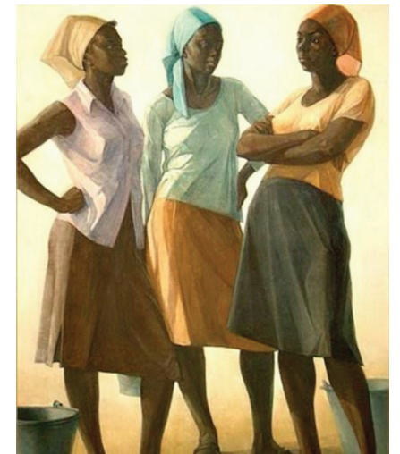
Barrington Watson Conversation, 1981 oil on canvas National Gallery of Jamaica, gift of Workers' Savings & Loan Bank. © Estate of Barrington Watson