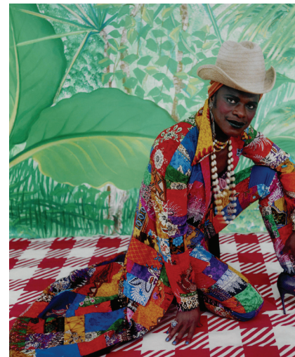
Samuel Fosso Self-Portrait (as Liberated Amer- ican Woman of the '70s), 1997, printed 2003 chromogenic print The Museum of Fine Arts, Hous- ton, Museum purchase funded by Nina and Michael Zilkha