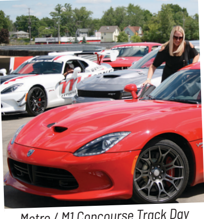
Metro / M1 Concourse Track Day