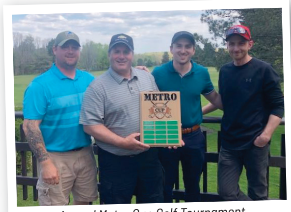
Annual Metro Cup Golf Tournament