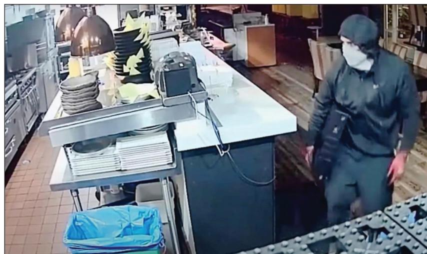
The video shows the moment the masked burglar smashed right through the side entrance plate glass door and into Funny Farm Restaurant on the corner of San Felipe and Yerba Buena.