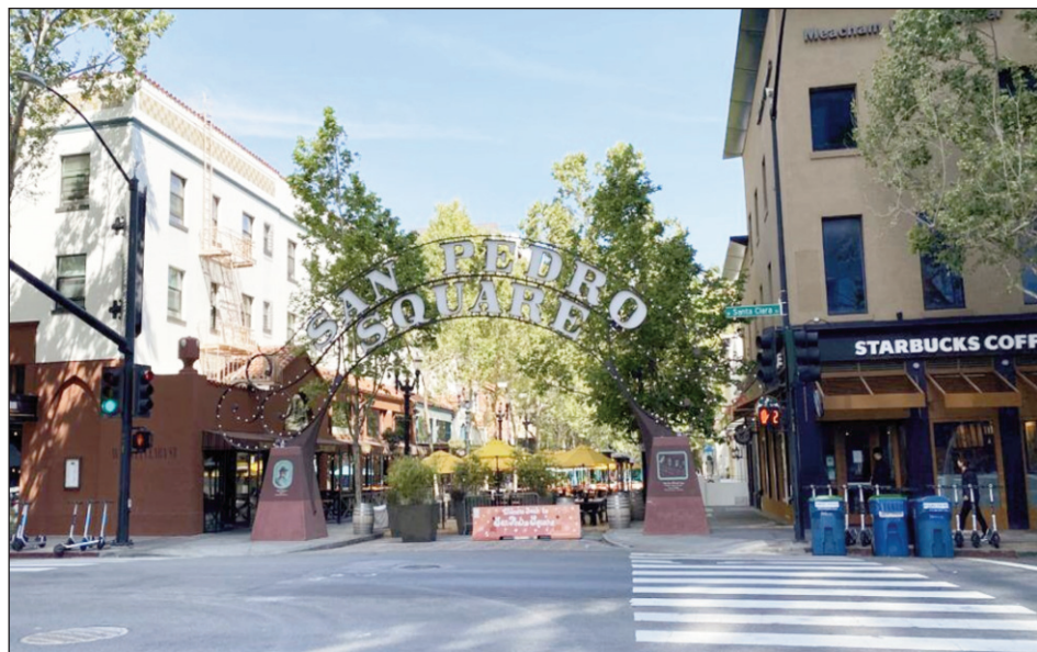
San Pedro Square in downtown San Jose features shops and restaurants.

Visit our website at www.allergycare.com .