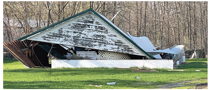
A storage building was completely demolished and the roof took a ride on the wind.

it up and put pieces back together," summed up Peysar. "This storm damage gives us the opportunity to do different things with the fair in terms using buildings and the grounds' structure and layout. I'm confident there will be positives that come out of this."