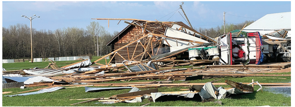
Damage at the Aitkin County Fairgrounds from last Wednesday's storms. Despite the damage the fair is still scheduled for July 6-9. Above are the remains of an industrial building that collapsed, along with the Chamber of Commerce Riverboat Float and stored watercraft.

The two fair buildings destroyed were a maintenance storage shed behind the westerly log building and a commercial exhibit building. The Aitkin Chamber's Riverboat float and boats in storage also sustained damage.