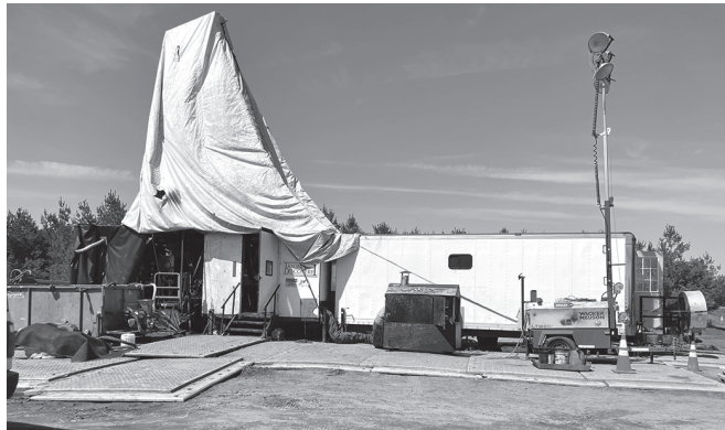
An exterior view of a Kennecott drill rig north of Tamarack.

The Tamarack operation now runs 24/7. One fourth of all the samples are kept for the DNR and stored in a rock library in Hibbing. Drillers work 12-hour shifts and there are eight remodeled homes to house workers on-