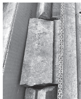
Samples containing nickel.

mine will begin in late 2022. The environmental review will be done first. If everything falls into place, nickel will be provided to Tesla starting in 2026. "The goal of our project is to supply nickel for electric cars," Johnson summed up.