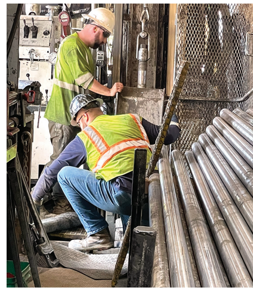
Inside the drill rig, as operators drill for core samples.