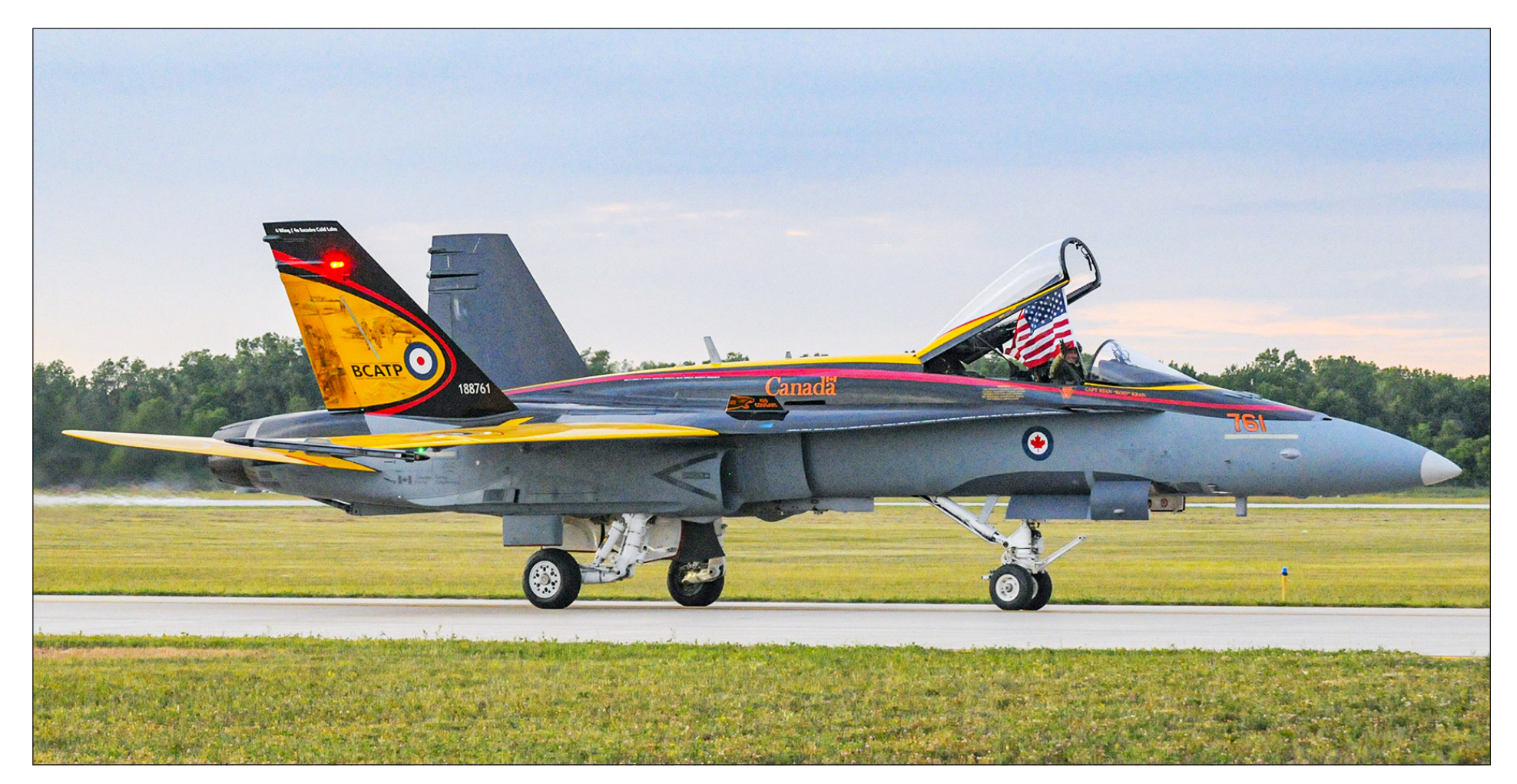
The CF-18 Demonstration team represents aviators of the Royal Canadian Air Force who conduct and support operations at home and worldwide every day. Showcasing the abilities of Canada's multi-role fighter through an impressive aerobatic routine, the team attends air shows and conducts flyovers across Canada and the United States. Each year, a new theme is chosen to highlight important milestones or ideas related to the military, Canada, or aviation. This theme is then translated into an impressive paint scheme on the team's CF-18 Demonstration jet and featured throughout the season, raising awareness and building audience interest.

A: No. Due to security and safety concerns, tents, beach,