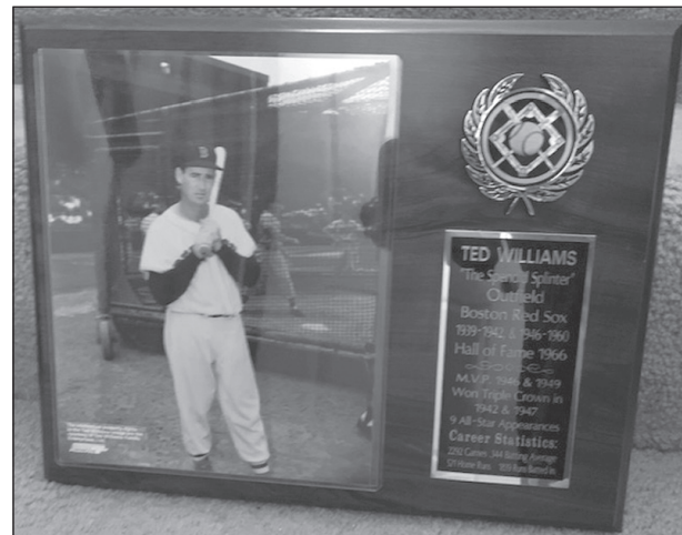
A plaque with a photo of Red Sox great Ted Williams is one of the many items available for bid in the upcoming CLT online auction.