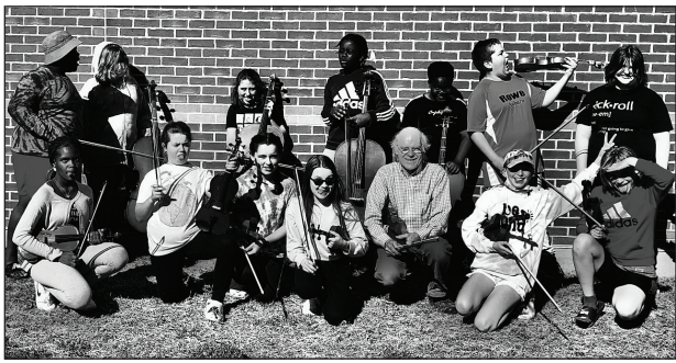
Lewiston Elementary All-Star Orchestra

LEWISTON, ME (May 12, 2022) -- The 2022 Music in the Park summer concert series begins on May 27 in Kennedy Park, Lewiston from 7-9 pm, and continues after each Art Walk L/A on final Fridays through September, 2022. Bring a lawn chair or blanket and enjoy some free, live music in the park!