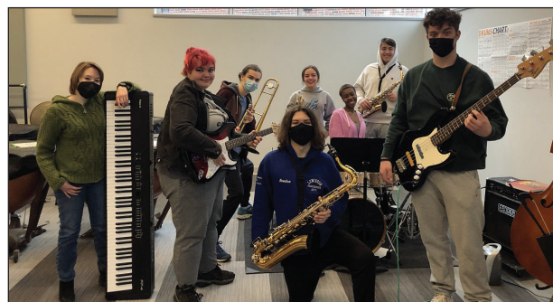
LHS Jazz Band 2022

All Star Orchestra Forêt Endormie Art Walk LA and all LA Arts programs would not be possible without the generous support of community partners including Community Arts Champion and Advocate sponsors Austin Associates, P.A., Bates College, Baxter Brewing Co., Berman & Simmons, the City of Auburn, the City of Lewiston, Liberty Mutual, Munka Coworking, the Sun Journal as well as