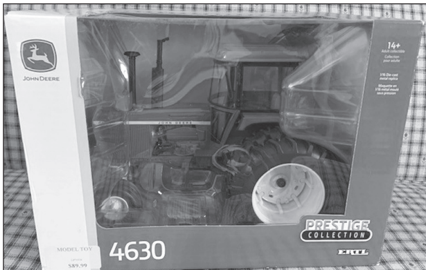
A John Deere tractor in original packaging is one of the items available for bid in the upcoming CLT online auction.

(May 20, 2022) -- The Lewiston-Auburn Community Little Theatre (CLT) will be holding its fourth annual "Not So Little Online Auction" from June 5-19.