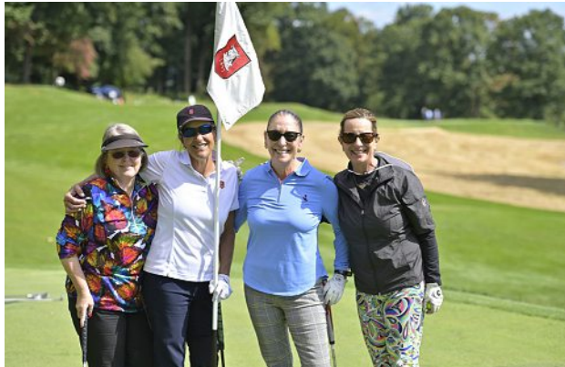
AHF Golf Outing: Wednesday, September 28, 2022