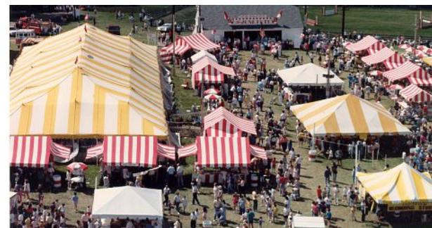
June Fete: Friday June 9 – Sunday June 11, 2023; Horse & Pony Show: Saturday, June 10, 2023