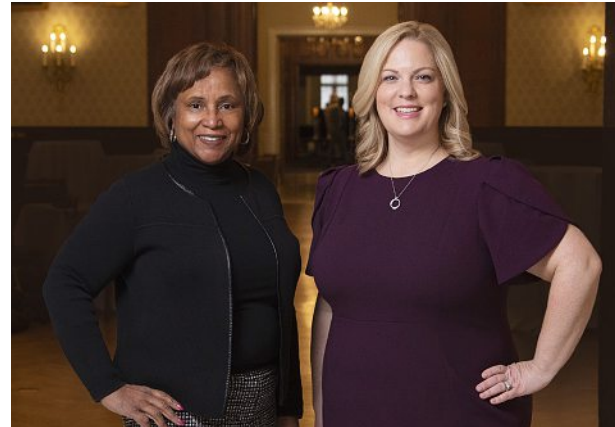
AHF Gala: Saturday, April 15, 2023