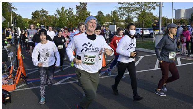
Race to Reimagine Cancer Care: TBD October, 2022