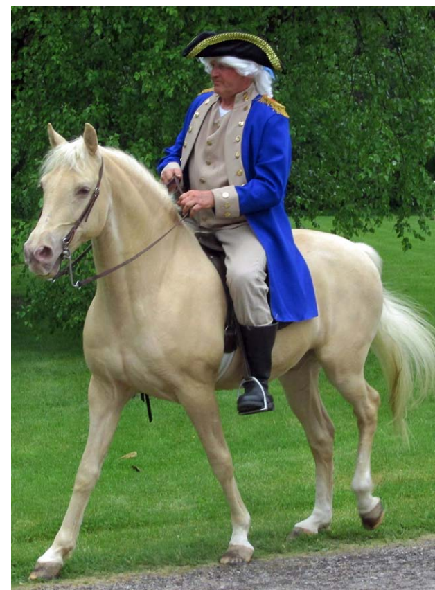
KIPTON MEMORIAL DAY PARADE

Memorial Day Parade and Ceremony Monday, May 30, 2022 8:30am Vermilion Veterans dedication Exchange Park corner of Main St. & Liberty Ave. 9:00am Veteran dedication at Maple Grove Cemetery, 8303 Cemetery Road 10:30am Parade kicks-off downtown on Liberty Avenue and end in Victory Park. 11:00am Ceremony Victory Park Luncheon to follow at the AMVET Post #22 located at 1517 State Road Vermilion, Oh