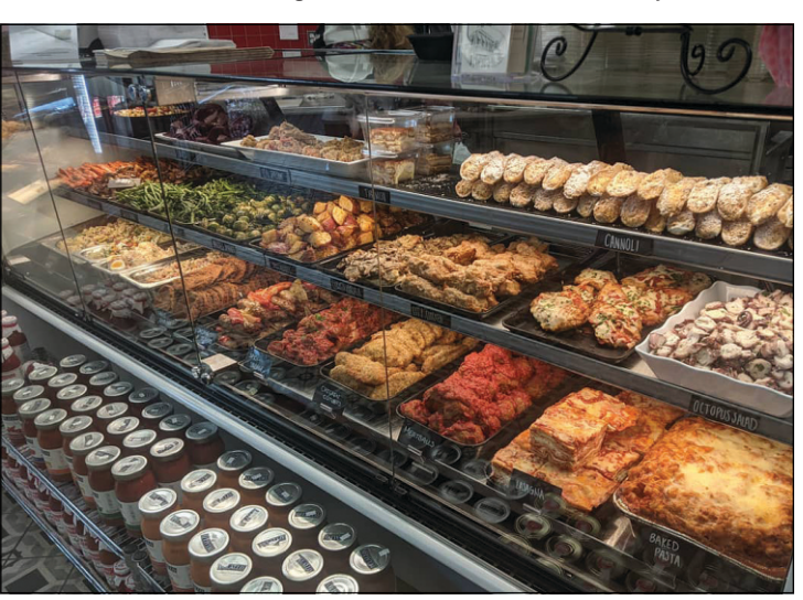
Everything at Ventimiglia Italian Foods is made from scratch with fresh ingredients, no preservatives, and from generations of triedand-true recipes.

up some of the best subs, pastas, prepared food, imported grocer-