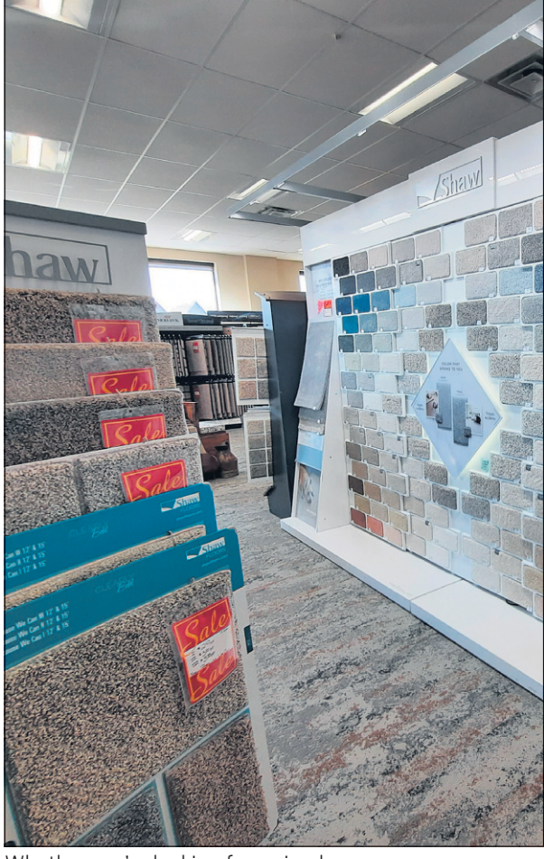
Whether you're looking for a simple area rug or a complete redo of your home's wood flooring, check out Villa Carpets for low-key but highly expert assistance.

Blascyk says a recent with residential remod- flooring-services.