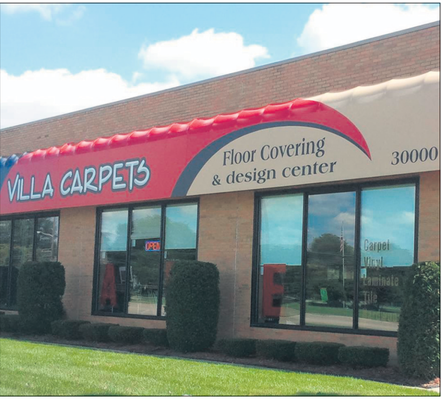
From choosing just the right color, pattern, and material for carpeting, to selecting the perfect blinds, sales staff at Villa Carpets can help.