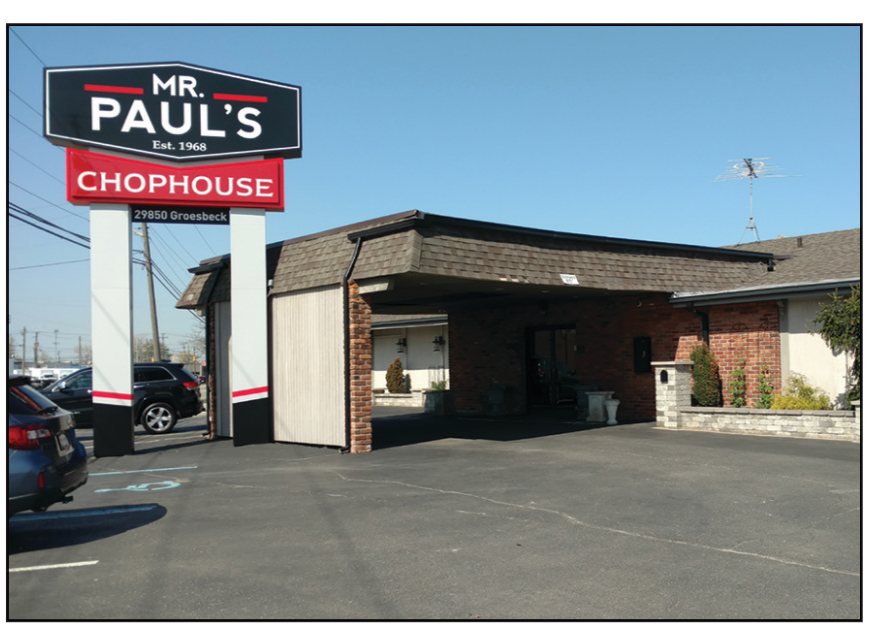
Mr. Paul's Chop House is located at 29850 Groesbeck Hwy. in Roseville.

Mr. Paul's Chop House is located at 29850 Groesbeck Hwy., Roseville. For more information or to make a reservation, call (586) 777-7770 or visit mrpaulschophouse.com