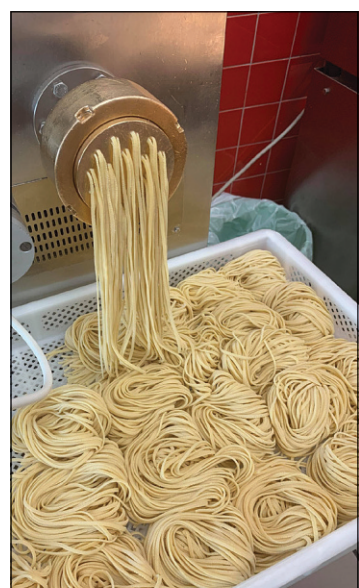
Freshly made pasta, soups, sauces and gelato are staples at Ventimiglia Italian Foods.

"It's something we do every For more information, visit This summer — as soon as year," he says, adding that he ex-ventimigliafoods.com.