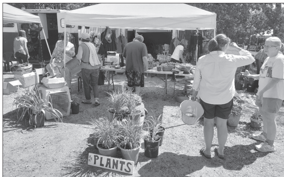
A sampling of the items that will be for sale at Skyline Farm.

NORTH YARMOUTH, ME (May 23, 2022) -- Come shop & Tack Sale at 95 The Skyline Farm's Yard Lane, North Yarmouth, on