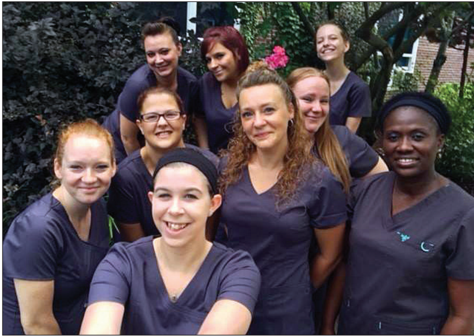
Certified nursing assistant students pose for a selfie outside Lewiston High School in 2016.

LEWISTON, ME (May 16, 2022) -- A new summer certified nursing assistant program through Lewiston Adult Education begins in July.