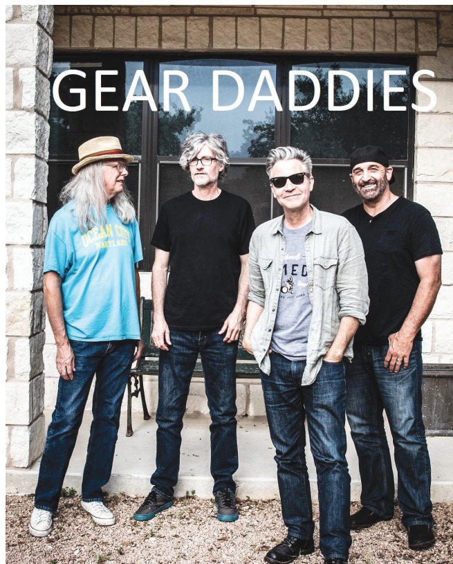
Iconic Minnesota Americana rock band Gear Daddies is coming to Aitkin on Friday, July 15 for a rare central Minnesota concert. Showtime is 7 p.m. The outdoor concert

is part of Long Lake Conservation Center's First Annual Nature Rocks - A Concert for Conservation, presented by Little Round Still, and will take place on Minnesota Ave. in front of Block North Brew Pub.