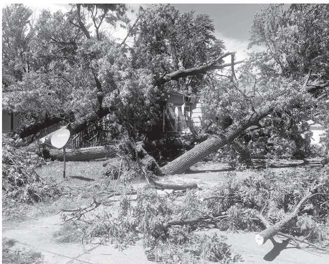
High winds uprooted trees and cause structural damage to property near the Cedarbrook area in Aitkin.