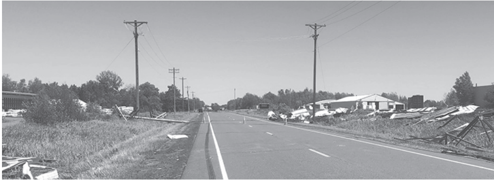
Clean up began after a storm with powerful winds and rain hit throughout the lakes area on Monday, June 20. The storm resulted in many downed trees, damaged property and loss of electricity in some areas. Above: The roof at Lakes States Lumber west of Aitkin was blown off resulting in downed power lines.