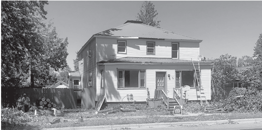
This house located on Hwy. 210 in Aitkin received damage from the storm.