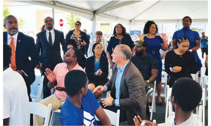
(Standing) Harbor Bank acknowledges its employees