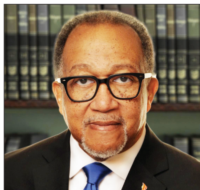
Ben Chavis of NNPA and PBS's Chavis Chronicles says the issue of diversity, equity and inclusion in the broadcast industry is major.

broadcast management to be inducted into the Broadcasting and Cable Hall of Fame, forming America's largest minority-owned, women-led broadcasting company.