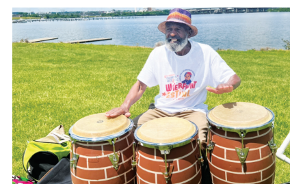
A man playing his Conga drum at the waterfront. The Cherry Hill Arts and Music Festival founders announced that Middle Branch Park will be the location for the festival.