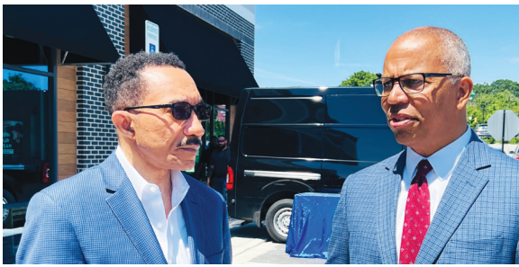
(l-r) Congressman Kweisi Mfume, 7th Congressional District and Lieutenant Governor Boyd K. Rutherford