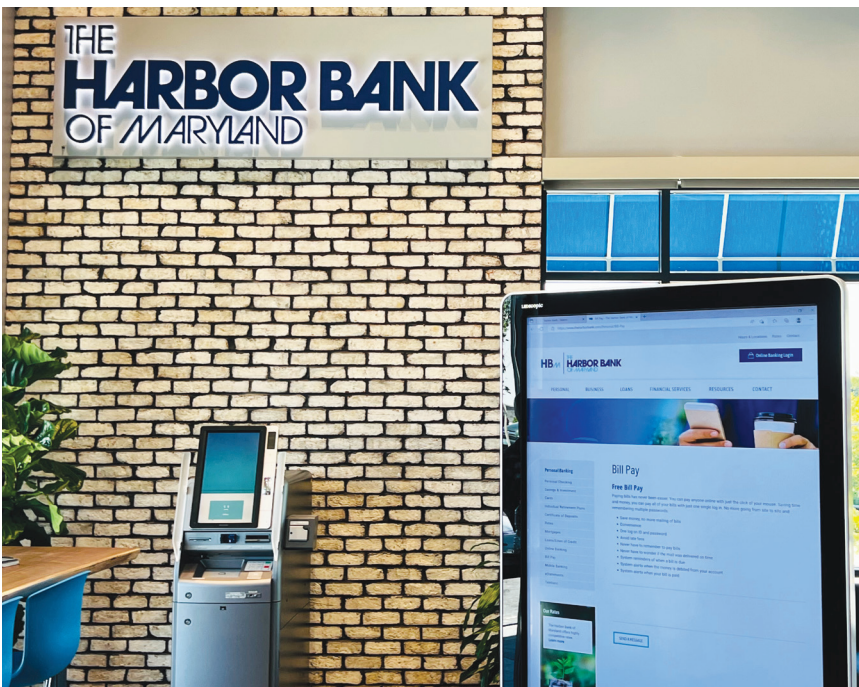
Inside the newly opened Harbor Bank of Maryland.