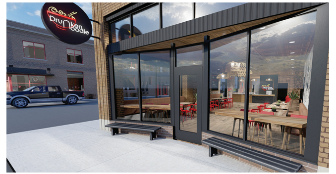
Architect's renderings of the front (above) and the east side (below) of the new restaurant scheduled to open in Crosby.