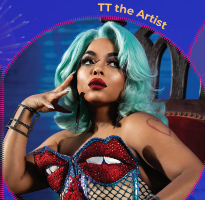
TT the Artist