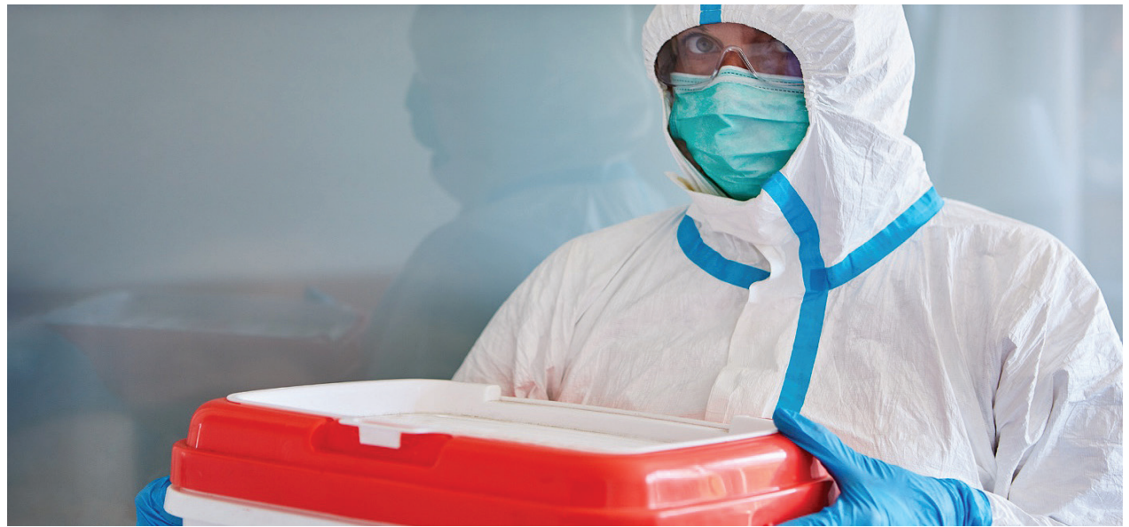
A new organ donation law goes into effect in Maryland on July 1, 2022.