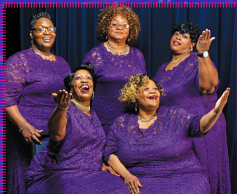
The Legendary Ingramettes