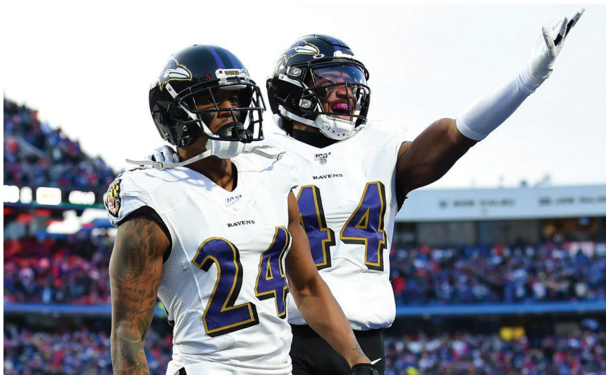
Marcus Peters (left) and Marlon Humphrey (right)