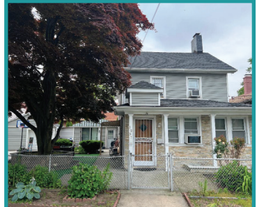
PELHAM BAY/HOLLYWOOD AVE 2 FAM W/ FINISHED BSMT 3 BED 1 BATH + BONUS RM, 2 BED 1 BATH, FAMILY RM 2 GUEST RMS 1 BATH ON 70.75 X 76.50 LOT $830,000