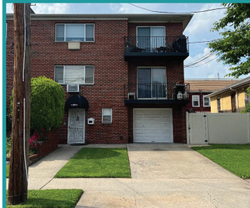
PELHAM BAY / LASALLE AVE TURN KEY 3 FAM, 3 BED / 2 BATH / BALCONY + 3 BED / 2 BATH / BALCONY+1 BED/1 BATH+ GARAGE / 3 HEATING SYSTEMS. $1,599,999