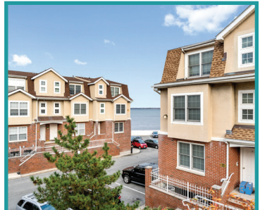
THROGS NECK / LONGSTREET LAGOON ESTATES WATERFRONT DEVELOPMENT 3 BEDS, 2½ BATHS DUPLEX CONDO BALCONY NEW KITCHEN, GARAGE, BEACH. $615,000

FREE MARKET ANALYSIS! WWW.CALLPRIMEREALTYFIRST.COM