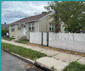
COUNTRY CLUB/WATERBURY AVE FULLY RENOVATED 3 BED 2 BATH RANCH FINISHED ATTIC & BASEMENT LARGE CORNER LOT. $699,000

Monday-Friday 9:00-6:00/Saturday 9:00-2:00 | Off Hours Accommodated by Appointment