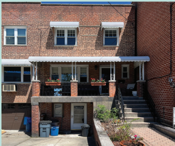
OPEN HOUSE - THURSDAY JULY 7TH 5:30 PM TO 8:00 PM 1130 VINCENT AVENUE COUNTRY CLUB 1 Family + IN-LAW - 3 BEDROOMS, 1½ BATHS DUPLEX FRONT AND REAR PORCHES, 1 BED, 1 BATH IN-LAW PRIVATE DRIVEWAY. $655,000