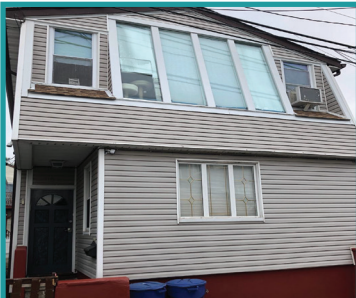
THROGS NECK / 34 C FIRST AVE WATER VIEW RENOVATED 1 FAM STEPS FROM PRIVATE BEACH 3 BDRMS NEW KITCHEN BATH AND PRIVATE PATIO. $428,999