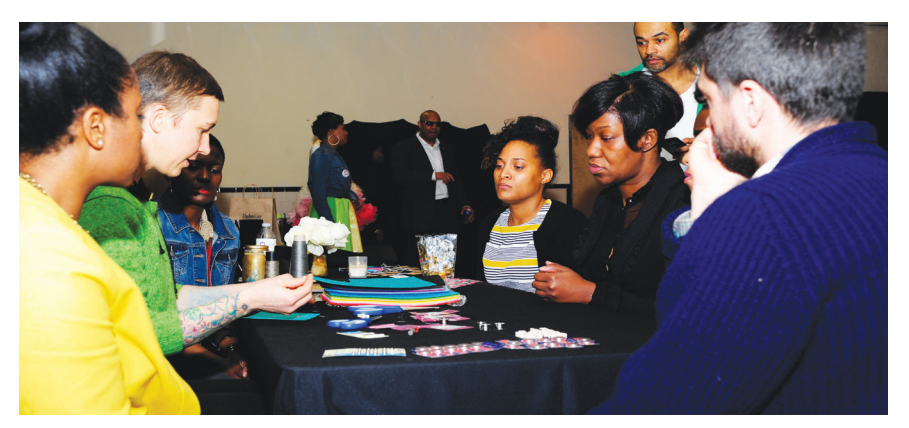
In 2016, interactive workshops developing wearables were held at GlamTech. It was rebranded as Wearable Tech Ventures.

Part II is coming next week. Please visit https://www. wearabletechventures.org/news-1 for more information about Tech REMIXed.