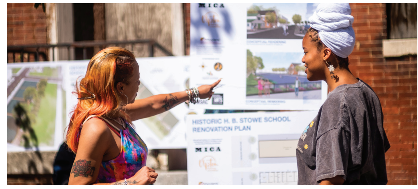
Event participants view development plans for the Natural Dye Initiative