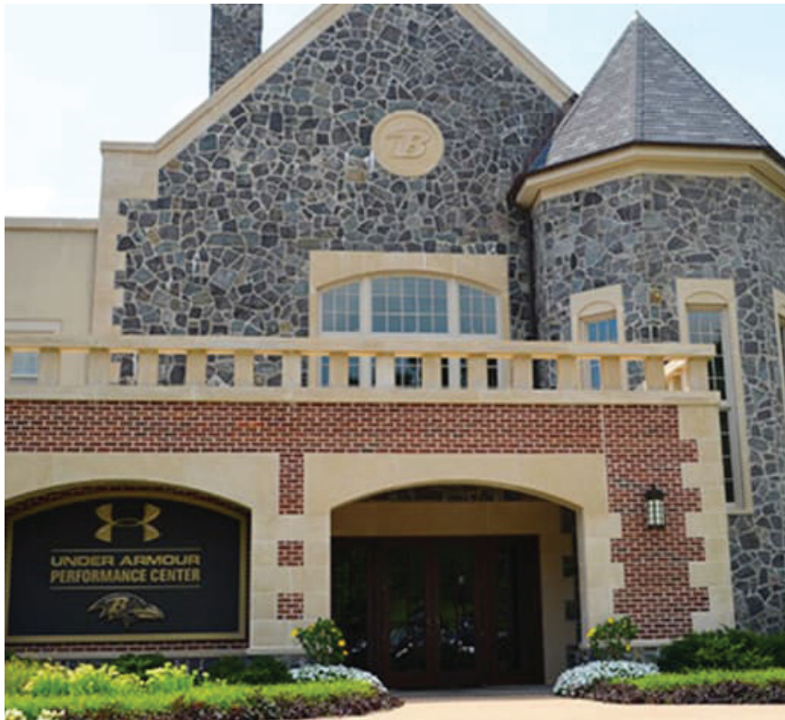
Under Armour Performance Center