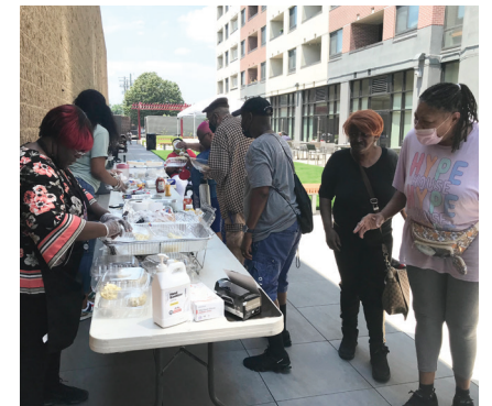
Residents were served grilled food, salad, and beverages.