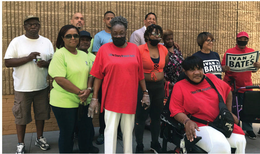
Residents and employees of the J. Van Story Branch Apartments during their cookout