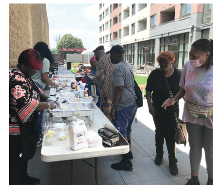
Residents were served grilled food, salad, and beverages.