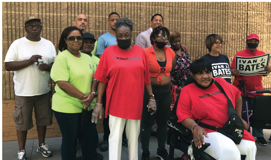
Residents and employees of the J. Van Story Branch Apartments during their cookout