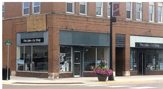
A new boutique, The Lake + Co. Shop, popped up in Crosby.

By ANN SCHWARTZ Across the street, to the west of Rafferty's Pizza in Crosby, The Lake + Co. Shop offers a pop-up boutique to area visitors and residents.