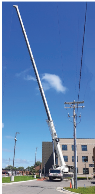
Work on the Aitkin County Courthouse utilized a crane earlier in July to lift two new roof-top heating/cooling units onto the government center.

When the steps and sidewalk are finished the project is considered completed. Readers may recall that the county demolished the oldest historical