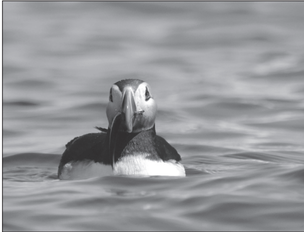
A puffin stares back at a kayaker next to Eastern Egg Rock