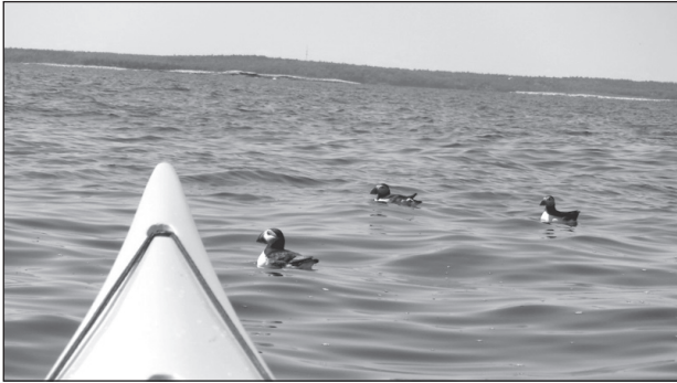
Puffins float just off the bow of a kayak near Eastern Egg Rock