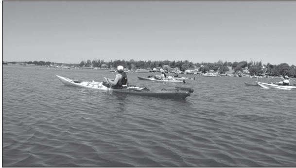
A team of kayakers paddle through Friendship Harbor