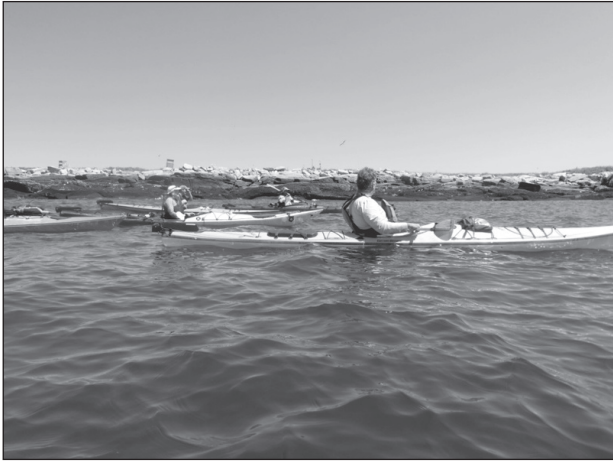
Sea kayakers arrive at Eastern Egg Rock