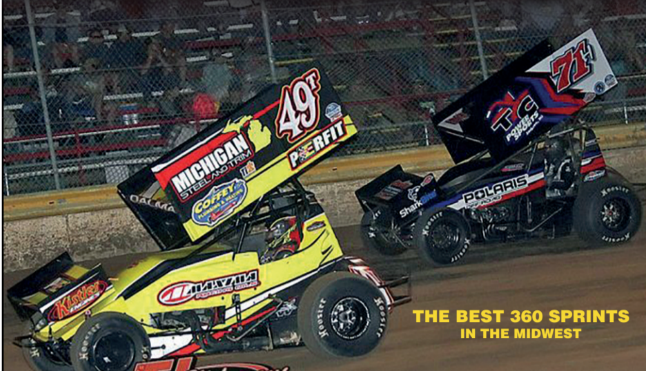
THE BEST 360 SPRINTS IN THE MIDWEST