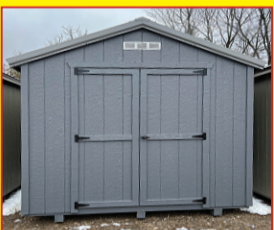
8x10 Bargain Barn $2,130 $99 Rent To Own