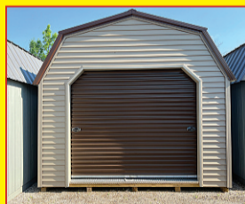
12x20 High Barn 8x7 Roll Up Door 8 Ft Loft, 1 Window $6,440 $299 Per Month