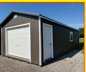
14x32 Gable 3 Windows, 4 Ft. Loft, Side Entry Door, 9x7 Garage Door $10,343 $480 Rent To Own