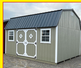
12x16 High Barn 2 - 4 Ft. Loft, 2 Windows $4,665 $220 Rent To Own