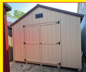
12x16 Bargain Barn $3,900 $180 Per Month