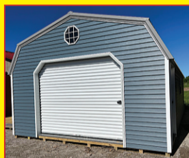
16x24 High Barn Side Entry Door, 8 Ft. Loft, 3 Windows, 9x7 Roll Up Door $10,375 $480 Rent To Own