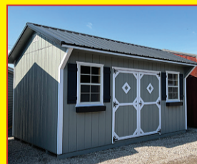
10x16 Quaker 2 4 Ft. Lofts, 2 Windows $4,372 $205 Rent To Own