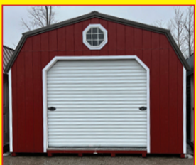
14x24 High Barn 8x7 Roll Up Door, 8 Ft. Loft, 1 Window $7,989 $370 Rent To Own