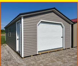
16x28 Gable 2 Windows, Side Entry Door 9x7 Roll Up Door $11,325 $525 Per Month