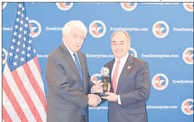
The pro-business group honors members of Congress for their votes and work on measures supporting job creation.

Maine Second District Congressman Bruce Poliquin received the Spirit of Enterprise Award from the U.S. Chamber of Commerce recently in recognition of his near-perfect score of 95% - among the highest ratings of all members of Congress - by the pro-business group for his work and votes to support job creation in Maine during his first year in Washington.