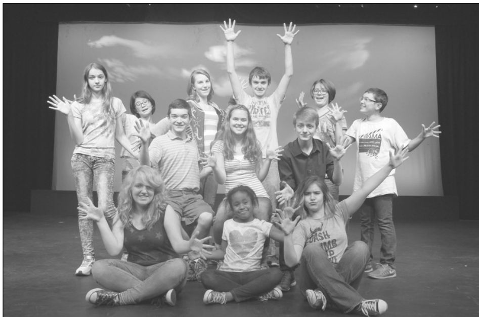
The program for young actors ages 11 through 16 runs July 11 through 29.

The Public Theatre is now accepting applications for its 2016 Professional Theatre Training Program for Young Actors ages 11 to 16. The program, which meets Monday through Friday from 9 a.m. to 4 p.m., includes during its morning sessions classes in stage combat, movement, voice and speech, singing and text analysis. Afternoon sessions consist of master acting classes and rehearsals. Taking place July 11 through 29, the three-week program culminates in a public performance at the end of the final week.