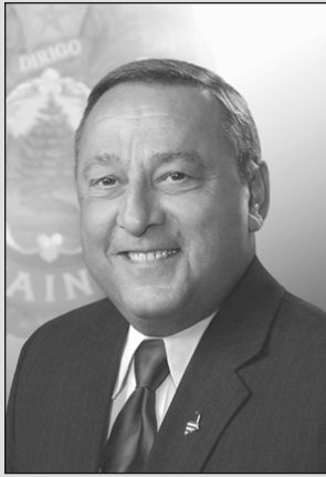
Governor Paul R. LePage

The solutions are right in front of us. The Legislature just has to act on them. First, the Executive Branch needs more authority over the tree growth program. With so much land in tree growth, not enough wood is being cut in Southern Maine, which drives up