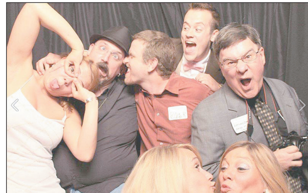
Mainely Improv, a professional troupe that specializes in making up comic situations entirely from audience suggestions, performs Friday, April 1.

The group's next performance will take place on Friday, April 1 at 7:30