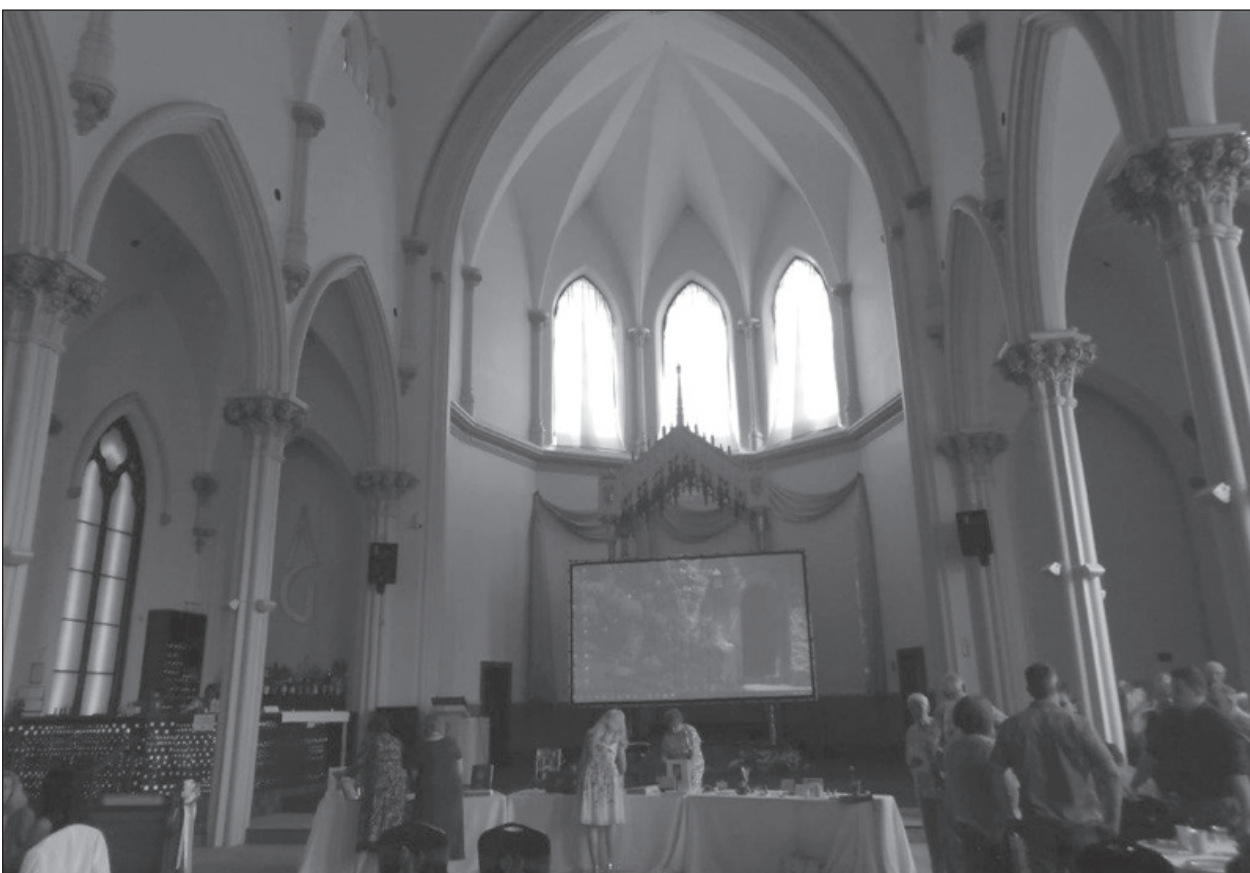
The altar remains at St. Patrick's Church.