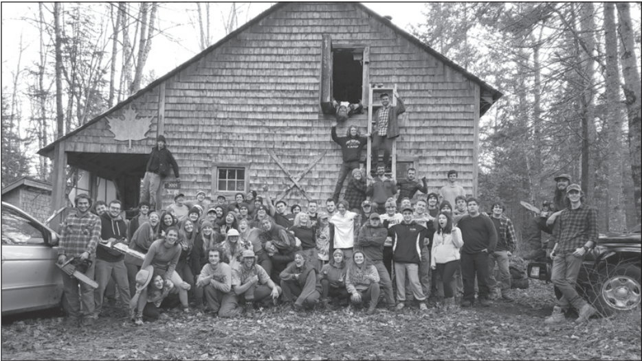
The Maine Outing Club at their cabin in Carrabassett Valley near Sugarloaf Mountain.

were chosen, the renovations would be a great way to celebrate the upcoming 100th anniversary of the club in 2023. The club members were shocked – and thrilled – when they learned their cabin had been selected. The Maine Outing Club’s cabin is an important part of the university club’s history. The original 1926 cabin at Chemo Pond was used as an off-campus trip destination for teaching basic camp skills before the building moved to Orono in 1938. The club’s cabin went through several rounds of demolishing and rebuilding on campus until 1958, when the club leased land near Sugarloaf Mountain from the Scott Paper Company to build a cabin that would serve as a central hub for club ski trips. Tucker says the cabin hosts dozens of students every winter. “We as a club just want to get more people to experience outdoor recreation and we do a really great job with that in the fall and in the spring, but it’s difficult in the winter,” he explains. “One of the highlights of the club has been the cabin and the access to Sugarloaf Mountain and the camaraderie it brings.” Tucker says that the