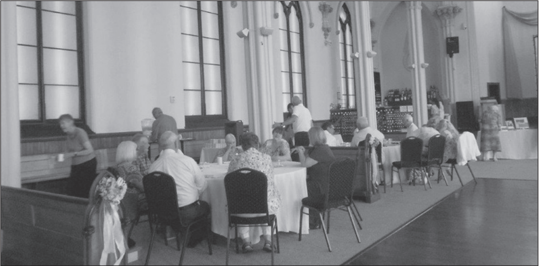
Many round tables added to the comfort for guests enjoying the luncheon.