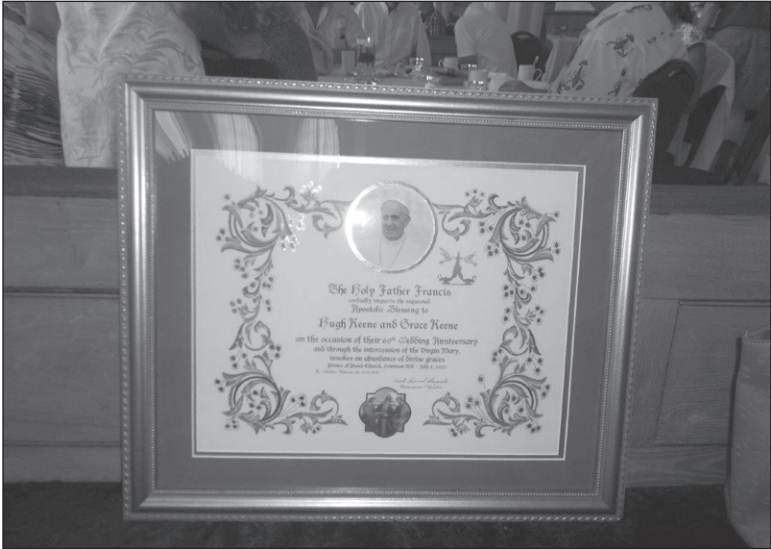
The Apostolic Blessing