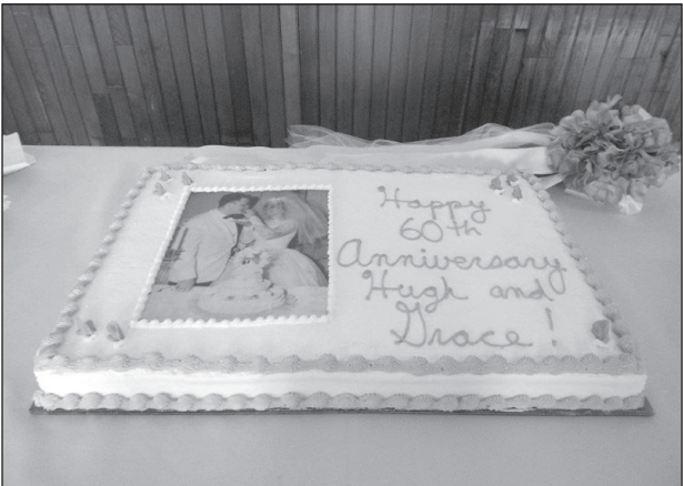
The wedding cake shows the nurturing begins!