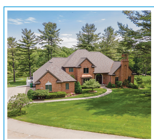
Custom Built 1 1/2 story walkout on 2 acres backs