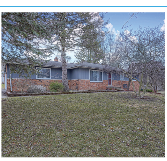
Lake Oakland access, 3 bedroom ranch.