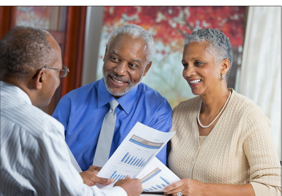
For \ \ some, \ \ a \ \ big \ \ fam- \ \ Downsizing \ can \ help \ you \ live \ a \ more \ active \ and \ healthy \ social \ life \ -- here's \ how.