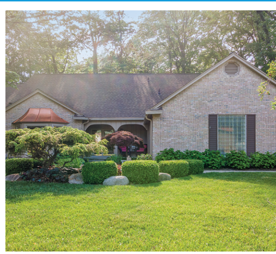
Custom built 1 1/2 story on private lot.