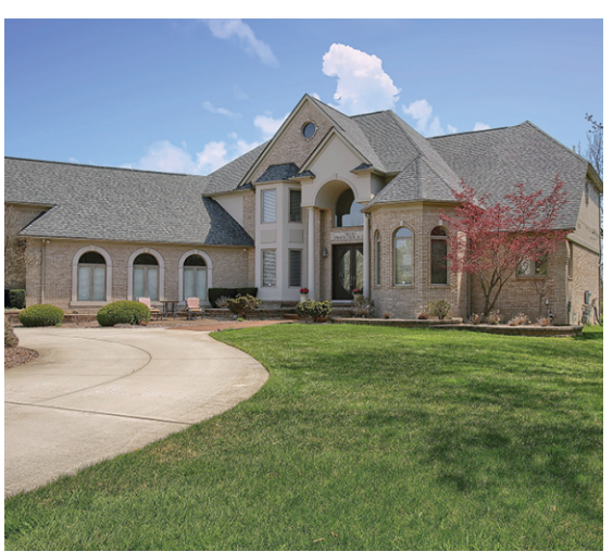
Custom 1 1/2 story with finished walkout

67263 Hidden Oak Washington Twp $799,900