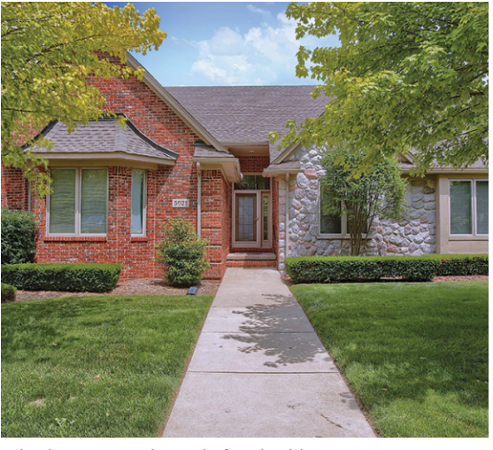
3 bedroom condo with finished basement.

38371 Huron Pointe Harrison Twp $3,450,000