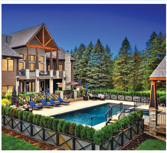
5 acre gated estate Ranch with walkout.