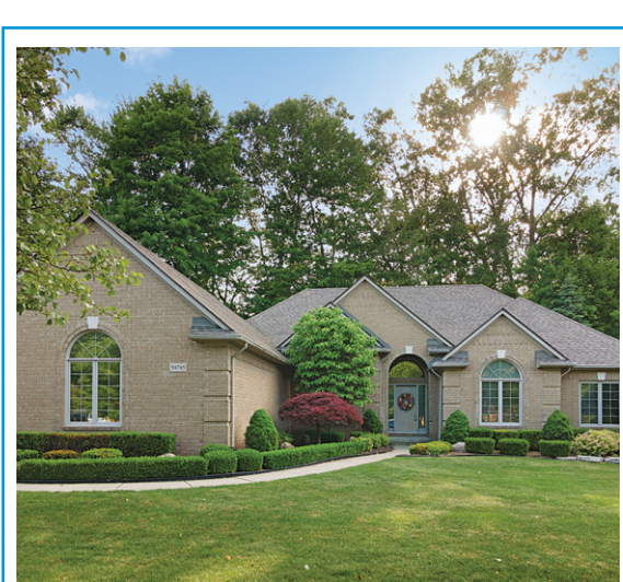
Great room ranch on private lot.