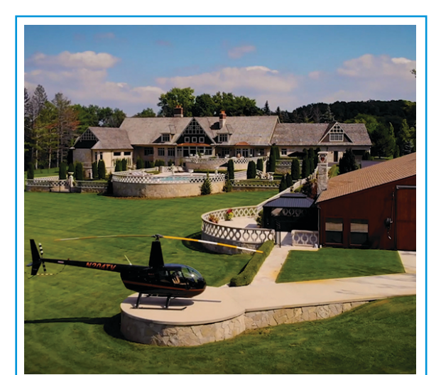
12 acre gated estate and helipad.