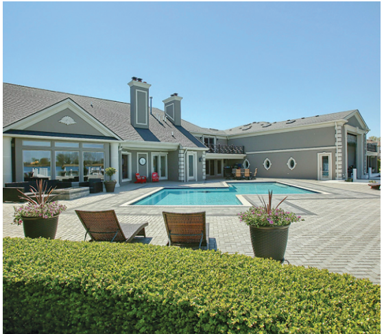
Lake St Clair, 55 ft boathouse.

38371 Huron Pointe Harrison Twp $3,450,000