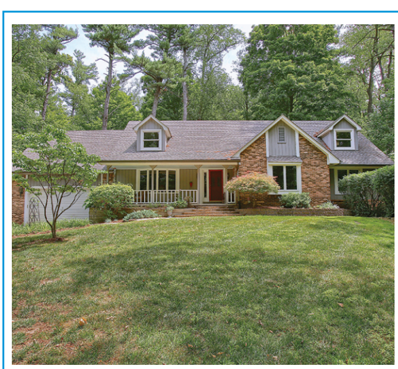
Private 10 acre setting.