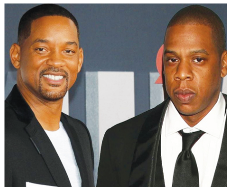
Will Smith and Jay-Z

"As part of its service, Landis provides coaching for clients on how to manage their finances to improve their credit and