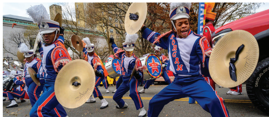
Morgan State University's Marching Band performs at the Macy's Thanksgiving Day Parade in 2019.