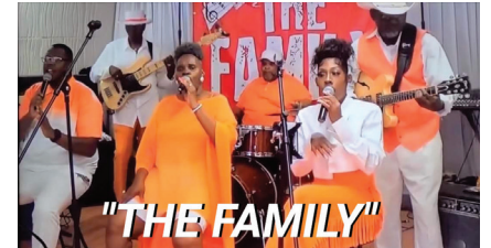
The Family will perform at the Ruth Kirk Festival on Saturday, August 6, 2022, at the Franklin Square Park.