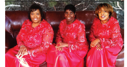
Serenity, a gospel group, will perform onstage at the Ruth Kirk Festival on Sunday, August 7, 2022, at the Franklin Square Park.

Baltimore Office of Promotion & the Arts has added to the Baltimore Farmers' Market lineup. The good news is that more entertainment will occur the first Sunday of the month, from now through October. It is a special monthly extension of the Baltimore Farmer's Market called the "B-Side." It will be held from 11 a.m.-3 p.m. in the same space as the Market, underneath the Jones Falls Expressway at Holliday & Saratoga Streets. After the regular market ends, you can enjoy an afternoon filled with a free performance showcase