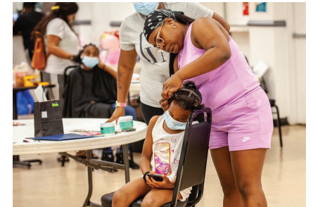
A volunteer braids a child's hair.

braiding or barbering service should promptly contact Contee by using the information provided above.