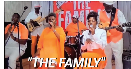
The Family will perform at the Ruth Kirk Festival on Saturday, August 6, 2022, at the Franklin Square Park.