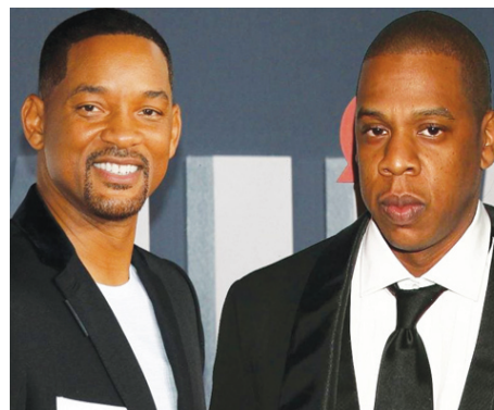
Will Smith and Jay-Z

"As part of its service, Landis provides coaching for clients on how to manage their finances to improve their credit and