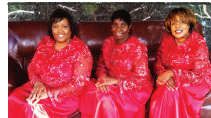
Serenity, a gospel group, will perform onstage at the Ruth Kirk Festival on Sunday, August 7, 2022, at the Franklin Square Park.