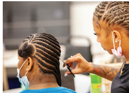
A stylist puts finishing touches on a braided hairstyle.

Contee even thought of approaching businesses she patronizes to thank volunteer braiders with gifts of gratitude last year, such as a free massage or facial. Boys and girls who were waiting for their hair braiding appointment could also engage in activities, or eat, in addition to adults who provided their generous gifts of talent, time, and desire to give back by helping children prepare for school.