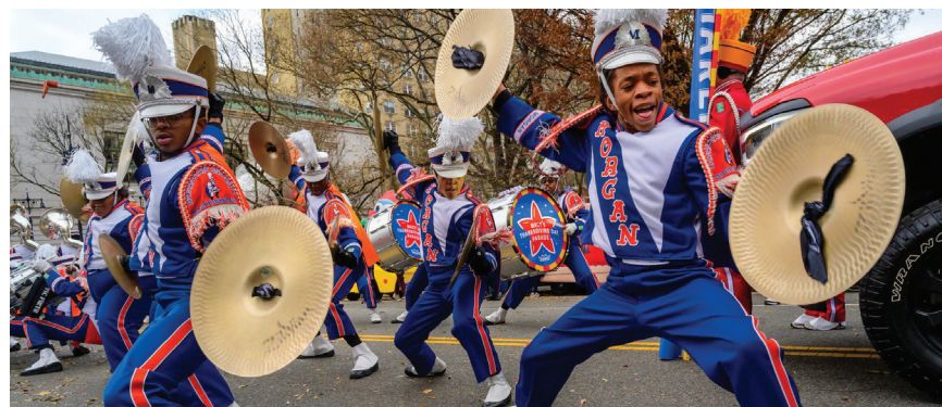
Morgan State University's Marching Band performs at the Macy's Thanksgiving Day Parade in 2019.